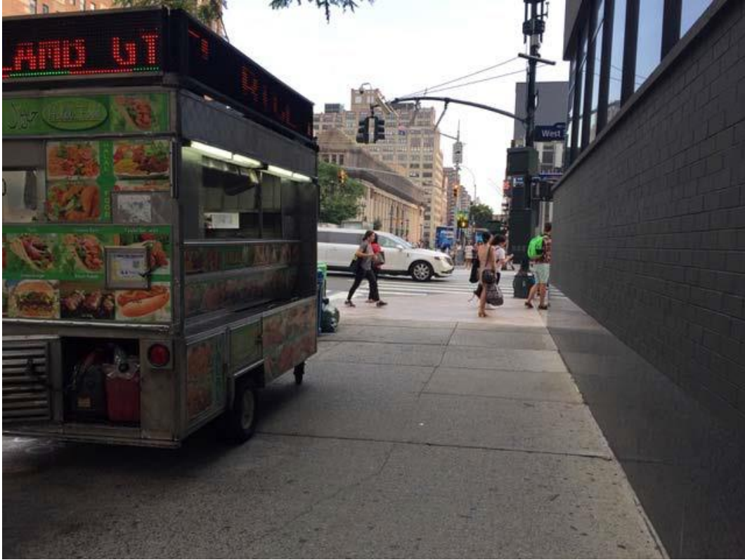
Queues go around the block, block pedestrian passage and attract illegal food vendors.