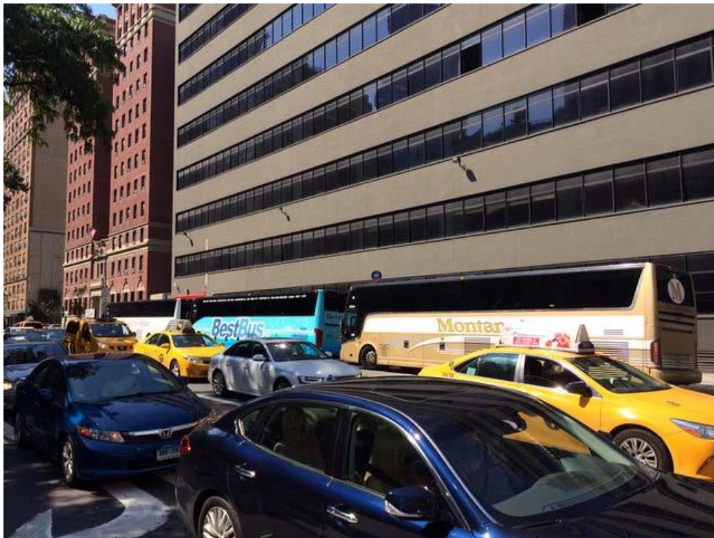
Looks like 3 buses together. Lots of traffic on sidewalk. Plus they use the eastbound side to let off passengers.