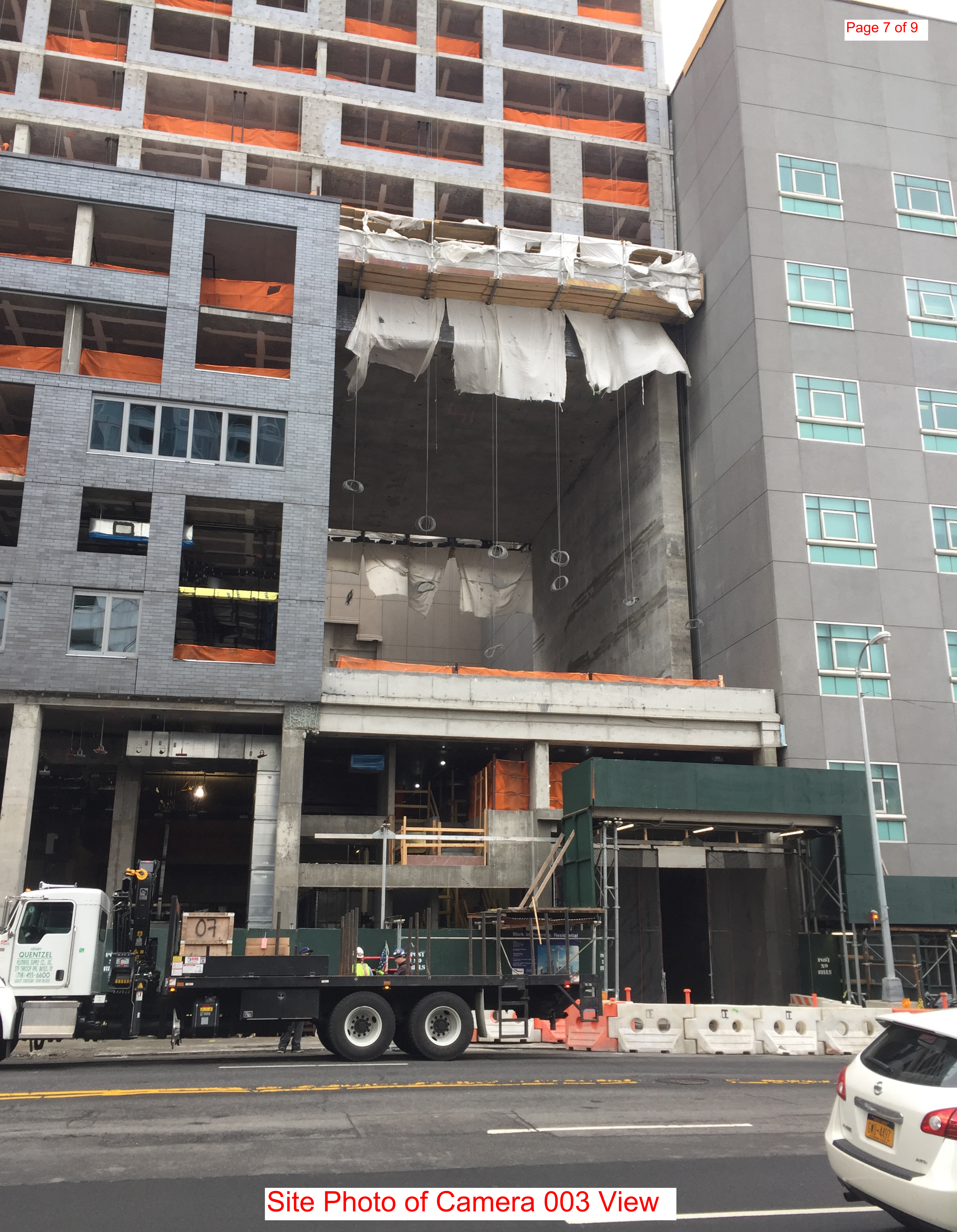
Site Photo of Camera 003 View