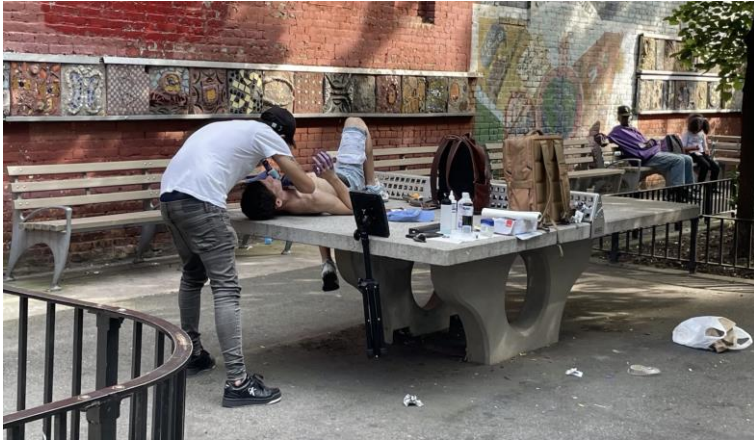
A makeshift tattoo parlor at Mathews Palmer Playground