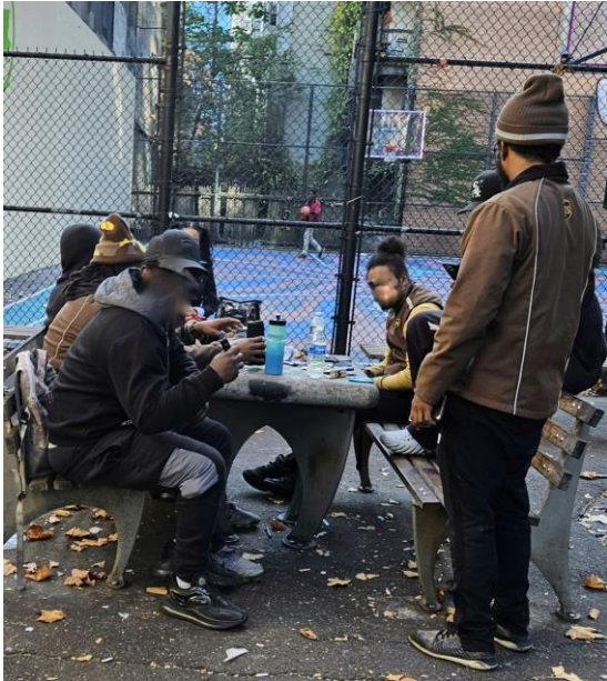
Drug activity midday at McCaffrey Playground