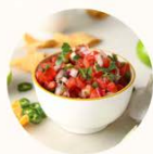
(Pico de Gallo)