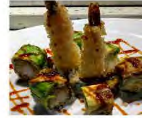
Eel Special 23 8pc Shrimp Tempura & Cucumber Topped with Eel, Avocado & Eel Sauce