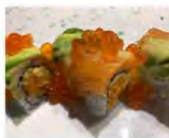
Salmon Family 21 8pcs Spicy Salmon, Mango & Crunch Topped with Salmon, Smoked Salmon Avocado & Ikura with Mango Sauce