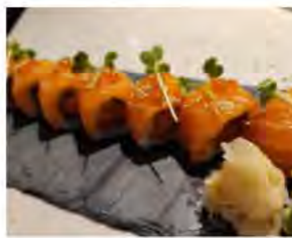
Golden Roll 19 8pcs Spicy Tuna & Salmon with Ikura on Top