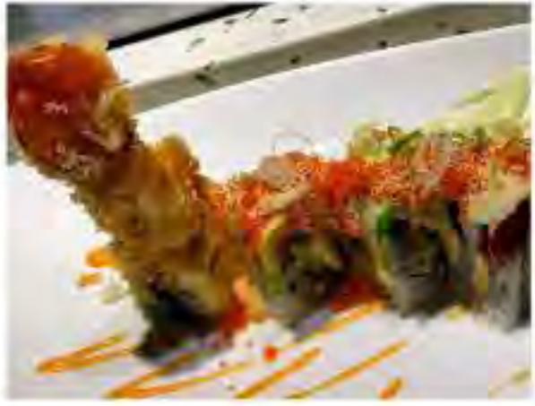
Million Dollar 26 8pcs Lobster Tempura Topped with Tuna, Salmon, Yellowtail, Avocado, Spicy Mayo, Wasabi Mayo and Tobiko Scallion.