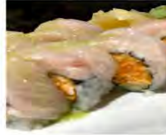
Hell's Kitchen 23 8pcs Spicy Crab, Jalapeno & Cucumber Tobiko with Yellowtail & Jalapeno Sauce