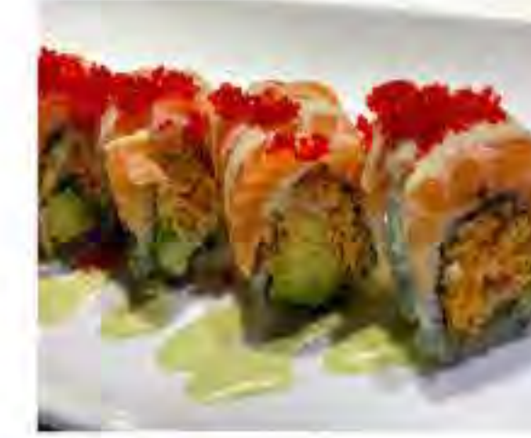
Spicy Lobster Dinosaur 23 8pcs Spicy Lobster Salad Avocado, Seared Salmon with Wasabi Mayo & Tobiko