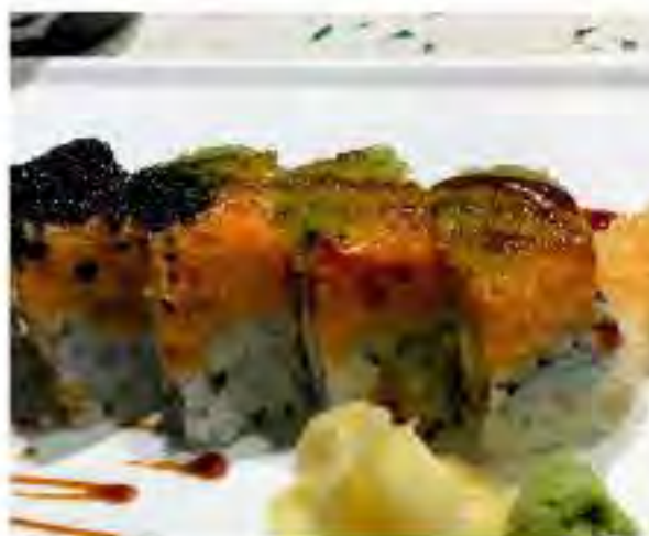
Sakura Roll 22 8pcs Shrimp Tempura & Cucumber Topped with Spicy Tuna, Eel Sauce, Spicy Mayo