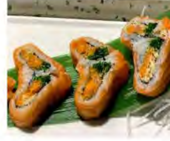
Passion 22 8pcs Spicy Tuna, Salmon, Yellowtail, & Seaweed Salad Topped with Salmon in a Heart Shape