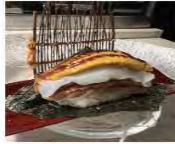
Big Mac (surf & turf) 30 Hand Roll Miyazaki A5 wagyu, sea scallop, sea urchin on the sushi rice and seaweed with truffle salt and eel sauce