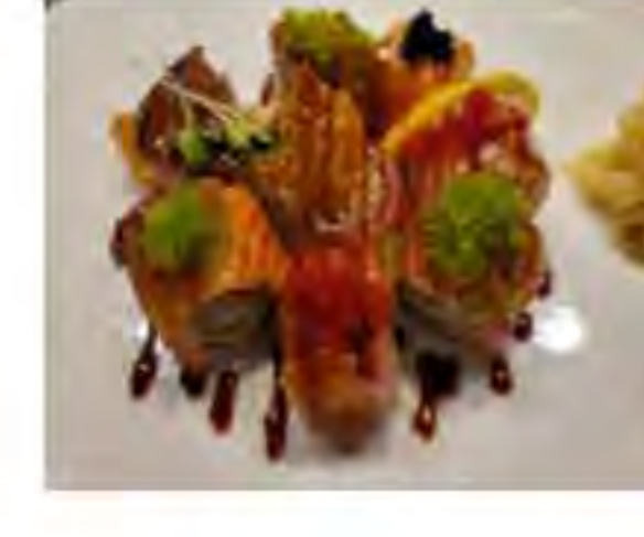
Monkey 22 8pcs Shrimp Tempura & Tobiko Topped with Tuna, Salmon, Yellowtail, Eel & Eel Sauce