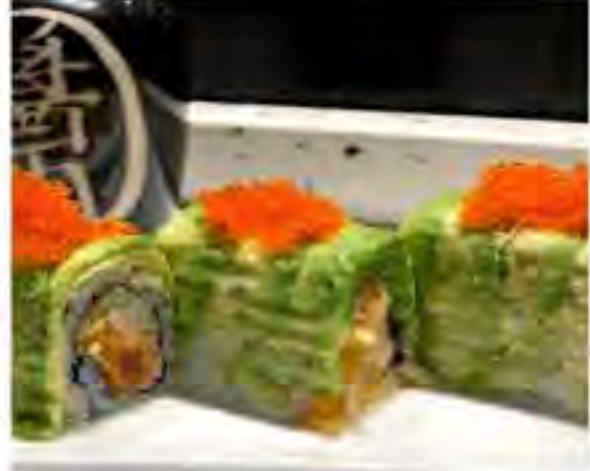
Godzilla 19 8pcs Spicy Tuna, Cucumber & Tempura Flakes Topped with Avocado & Tobiko