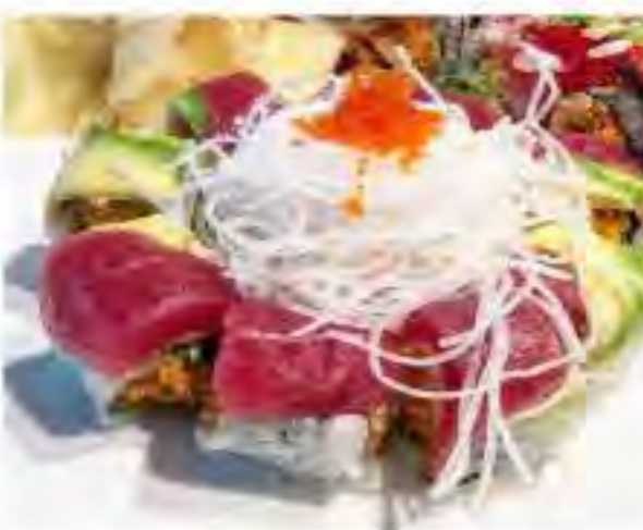
Out of Control 22 8pcs Spicy Tuna & Kaiware Topped with Avocado & Tuna