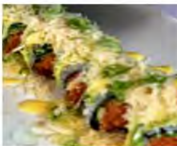
Spicy Toro Jalapeno 23 8pcs Spicy Toro, Jalapeno, Avocado, Mango Sauce, Crunch Topped with Scallion