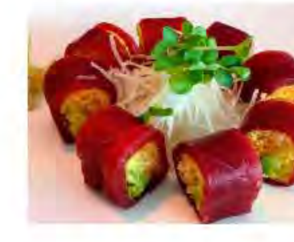
Blue Mango 22 8pcs Riceless Roll with Spicy Crab, Mango & Avocado Wrapped with Tuna