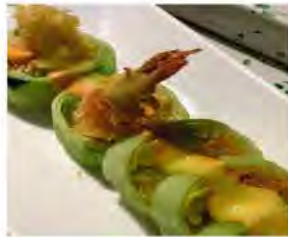
Tiger Eye 19 5pcs Riceless Roll Shrimp Tempura, Avocado Spicy Lobster, Jalapeno Wrapped in Cucumber & Topped with Spicy Mango Sauce