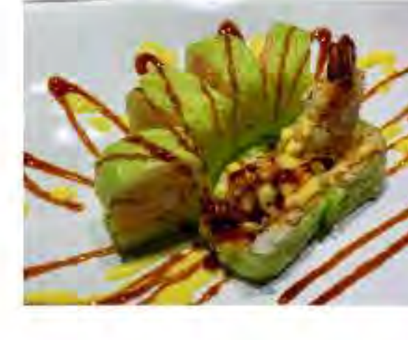
Thunder Roll 19 6pcs Lobster Salad, Shrimp Tempura & Mango Wrapped in Soybean Paper with mango & Eel Sauce