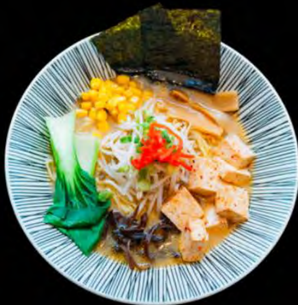
Veggie Miso Ramen