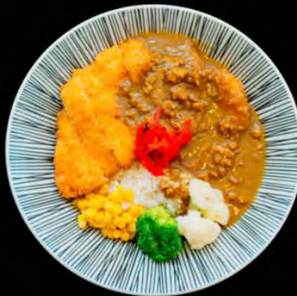
Curry Chicken Katsu Don