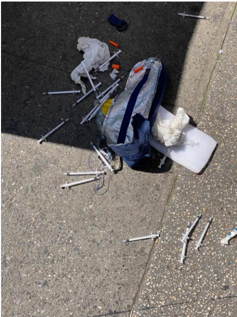
Pic. 2 Found on W. 36th St.