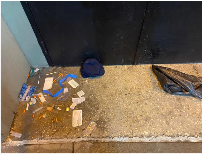
Pic. 1 361 W. 36th St. residential building entrance showing needles, alcohol swipes and "cooking" tins.