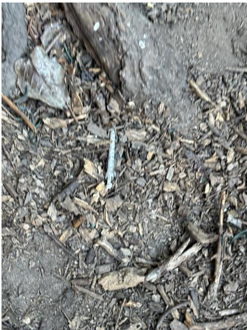
Pic. 4 Found in Ramon Aponte Playground on W. 47th St. next to PS212 elementary school.