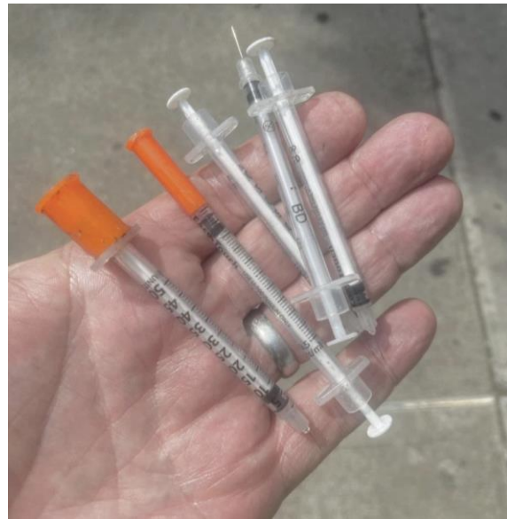
Pic. 3 Found at the entrance of PS51 elementary school on W. 44th St. A parent discarded them due to the urgency. This was not recorded to 311.