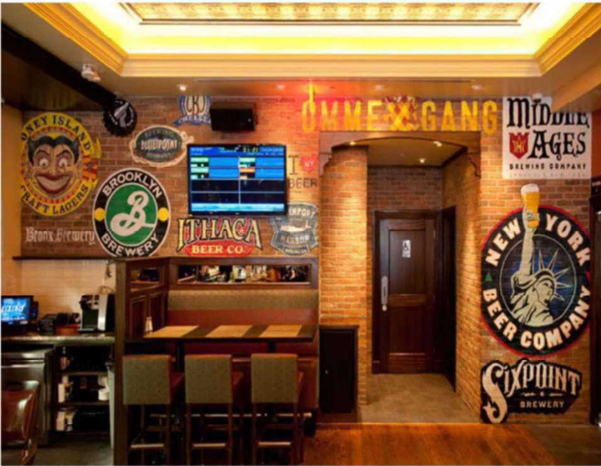
New York Beer & Beverage LLC 321 West 44th Street, Unit 103A New York, NY 10036 November 29, 2021