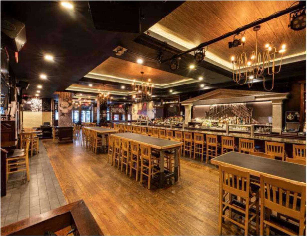
New York Beer & Beverage LLC 321 West 44th Street, Unit 103A New York, NY 10036 November 29, 2021