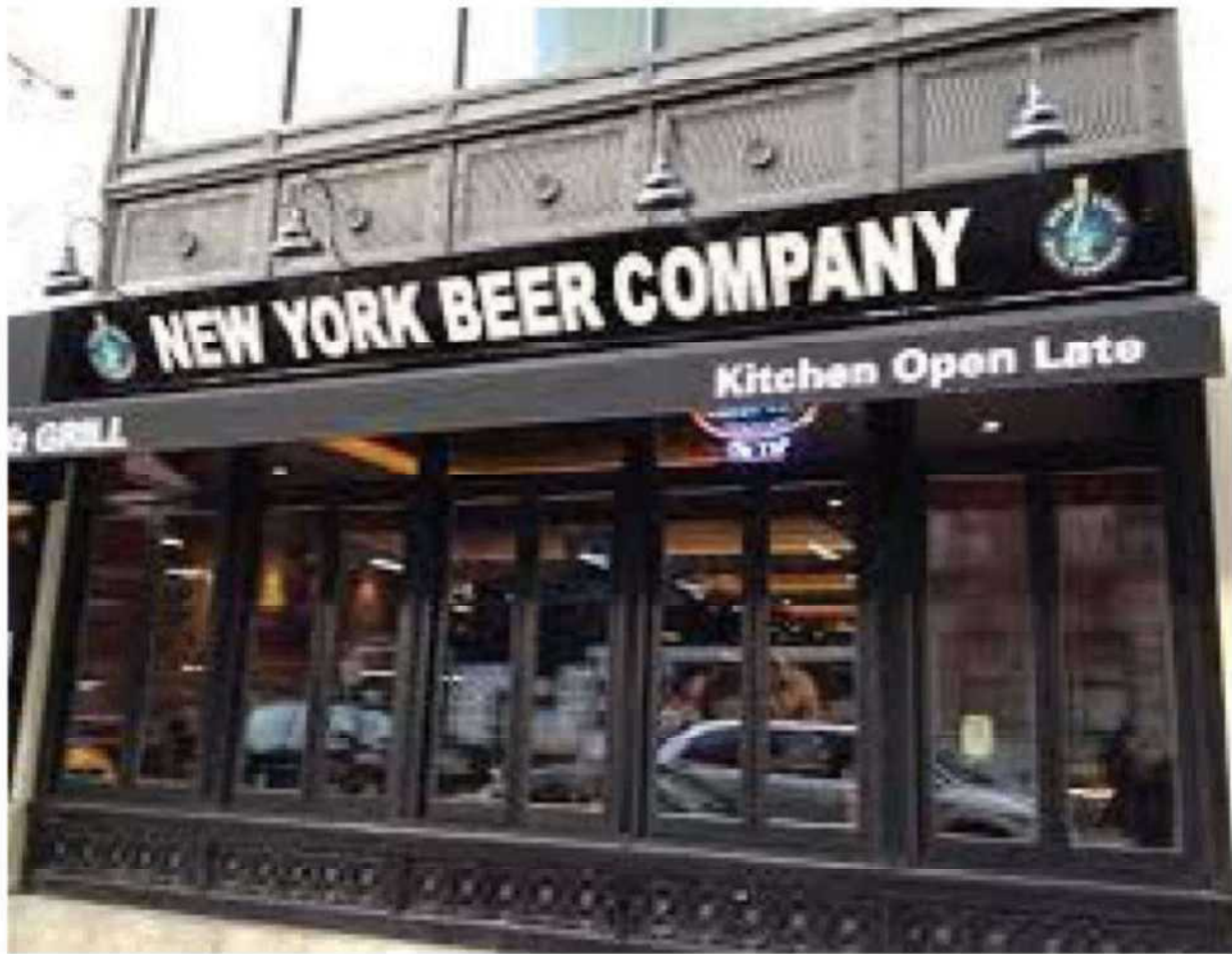
New York Beer & Beverage LLC 321 West 44th Street, Unit 103A New York, NY 10036 November 29, 2021