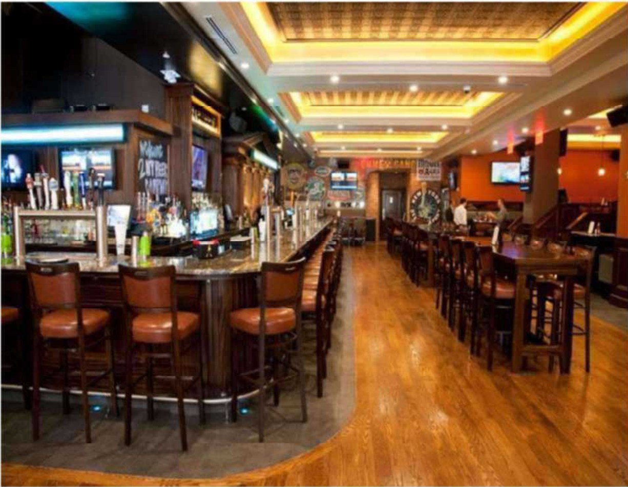
New York Beer & Beverage LLC 321 West 44th Street, Unit 103A New York, NY 10036 November 29, 2021