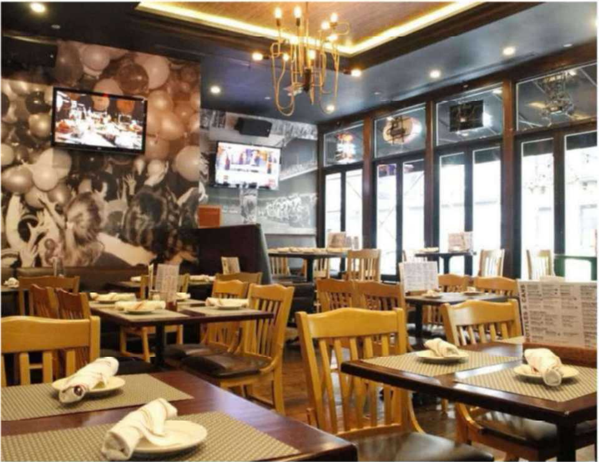
New York Beer & Beverage LLC 321 West 44th Street, Unit 103A New York, NY 10036 November 29, 2021