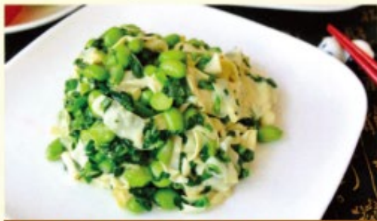
42 Soy Bean w. Pickled Cabbage & Thin Tofu Skin 10.95 醬菜百葉毛豆 수에자이에다마메