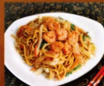
68 Shrimp Lo Mein 9.95 蝦撈面 새우 면요리