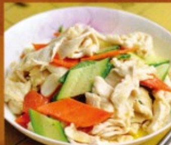
24 Chicken Noodle Soup 8.95 雞肉湯麵 치킨탕면