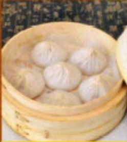
10 Steamed Pork Soup Dumpling (每) 6.95 鮮肉小籠包 고기소샤오톡보오