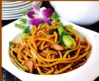
48 Fried Udon w. Pork 肉絲粗炒麵 고기채볶음면