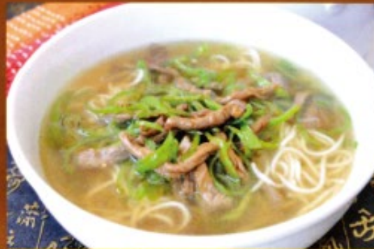
22 Beef Noodle Soup w. Chili Pepper 9.95 小椒牛肉湯麵 우육탕면