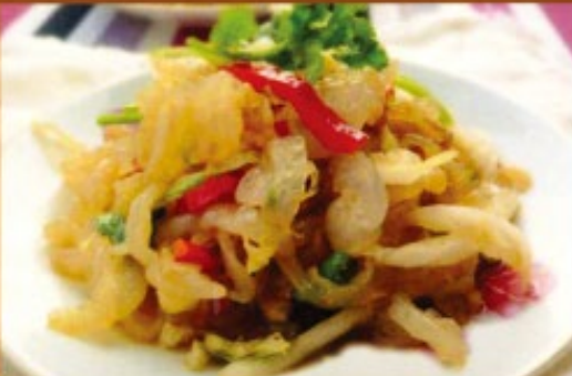
10 Marinated Jellyfish 7.95 凉拌海蜇 레파리