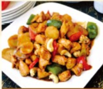
27 Chicken w. Cashew Nuts 11.95