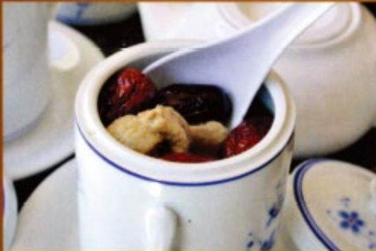
19 Herbal Chicken Soup w. Date 5.95 紅棗燉雞湯 대추찜닭탕