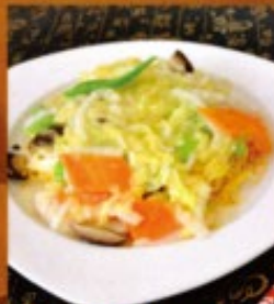
56 Crispy Noodle w. Vegetable 7.95 素菜兩面黃 야채양면황