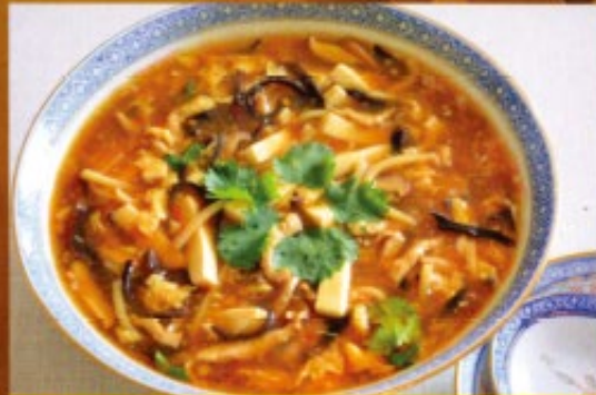
20 Hot & Sour Soup sm. 3.95 lg. 5.95 酸辣湯 삼라탕