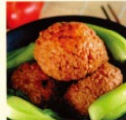
34 Meat Ball w. Soy Sauce 15.95