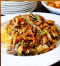
53 Crispy Noodle w. Shredded Pork 8.95 肉絲兩面黃 고기채양면황