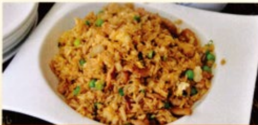
77 Shredded Pork Fried Rice 8.95 肉絲炒飯 제육볶음밥