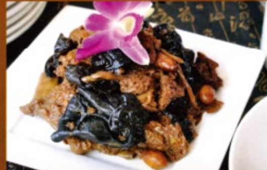
14 Four Happiness Baked Bran 6.95 四喜烤麩 쓰시카오푸