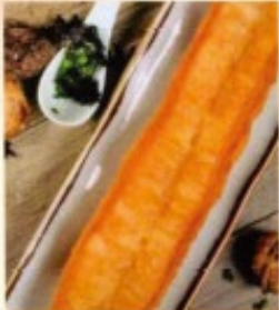
2 Fried Crispy Dough 2.95 油條 여우타오