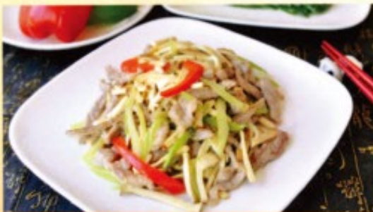
32 Shredded Pork w. Celery & 5 Spice Dried Tofu 11.95