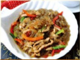
71 Clear Vermicelli w. Shredded Pork 9.95 肉絲炒水晶粉條 고기채크리스탈면/러우스크리스탈면