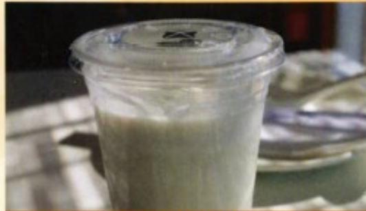
85 Coconut Juice w. Tapioca 3.95 (Cold only) 椰汁西米露 (冷) 난과시미루 (냉요리)