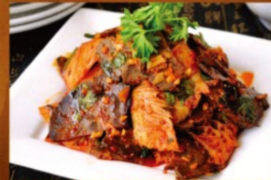
17 Spicy Beef & Tripe 8.95 夫妻肺片 부처페편