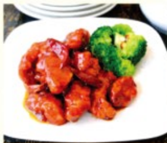
29 General Tso's Chicken 13.95