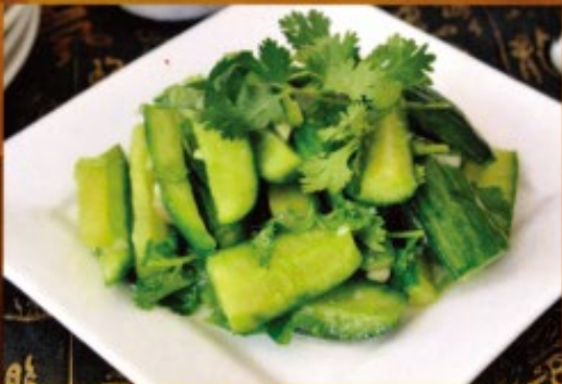
15 Cucumber Salad 5.95 凉拌黃瓜 오이무침