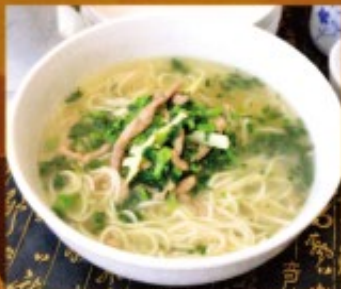
23 Shredded Pork & Cabbage Noodle Soup 8.95 醬菜肉絲湯麵 설채탕면