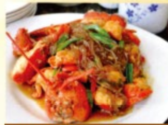
74 Clear Vermicelli w. Lobster S.P. 龍蝦水晶粉條 랍스터 크리스탈면 / 랍스터 당면