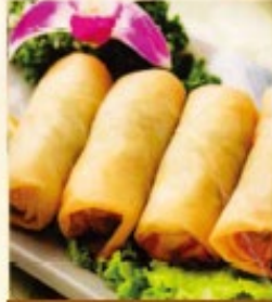
7 Spring Roll (4) 5.95 Sm (2) 3.95 三絲素春卷 스프링 롤