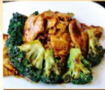
28 Chicken w. Broccoli 12.95