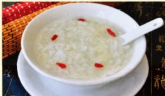
86 Sticky Rice Ball in Liquor Soup w. Egg 3.95 酒釀丸子 주냥알자