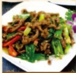
36 Shredded Beef w. Scallion 12.95 蔥爆牛肉絲 송포우 쇠고기