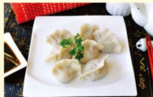
9 Seafood & Pork Dumpling (6) 6.95 三鮮水餃 삼선물만두