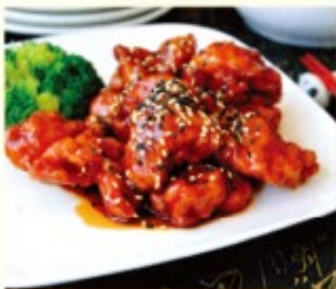
30 Sesame Chicken 13.95