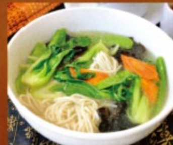
25 Vegetable Noodle Soup 7.95 素菜湯麵 야채탕면