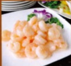
38 Stir Fried Baby Shrimp 13.95 清炒蝦仁 새우볶음