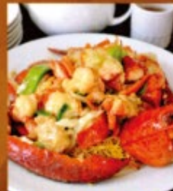
57 Crispy Noodle w. Lobster SP 龍蝦兩面黃 랍스터 크리스피면