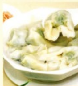
5 Shepherd's Purse Wonton (6) 7.95 薺菜餛飩 삼선춘돈