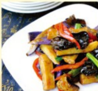
44 Eggplant w. Garlic Sauce 10.95 魚香茄子 위이상가지어향가지