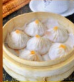
11 Steamed Crab Meat & Pork Soup Dumpling (每) 7.95 蟹粉小籠包 하이린샤오톡보오