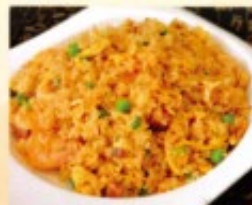
81 Hot & Spicy Fried Rice 8.95 香辣炒飯 양저우볶음밥