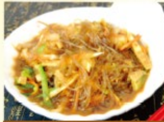
73 Clear Vermicelli w. Vegetable 8.95 素菜炒水晶粉條 야채크리스탈면