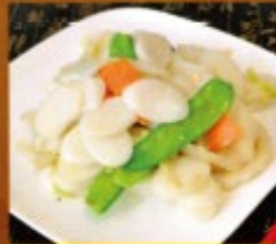
62 Rice Cake w. Vegetables 8.95 素菜炒年糕 야채떡볶이