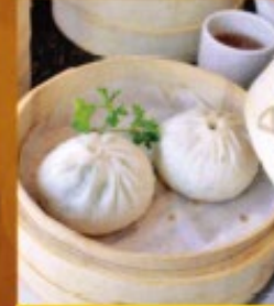
13 Vegetable Bun w. Mushrooms (每) 5.95 香菇菜包 버섯왕만두