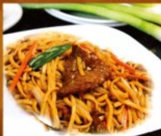
67 Beef Lo Mein 9.95 牛肉撈面 소고기 면요리