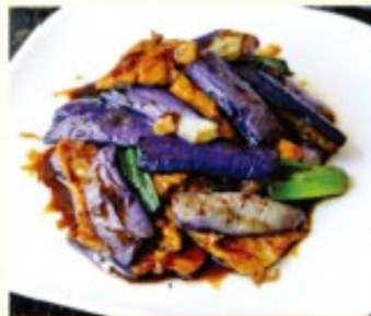
31 Chicken w. Eggplant 12.95