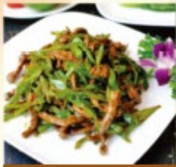
35 Shredded Beef w. Chili Pepper 12.95 小嫩牛肉絲 고추쇠고기볶음