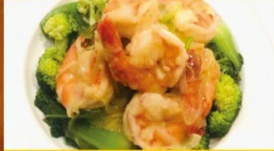
41 Jumbo Shrimp with Ginger Sauce 14.95 薑蔥大蝦 생강 새우