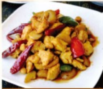
26 Chicken w. Peanuts in Hot Pepper Sauce 10.95