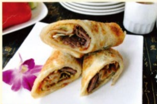
4 Pancake w. Sliced Beef 6.95 牛肉夾餅 쇠고기전