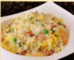
80 Young Chow Fried Rice 9.95 揚州炒飯 양저우볶음밥