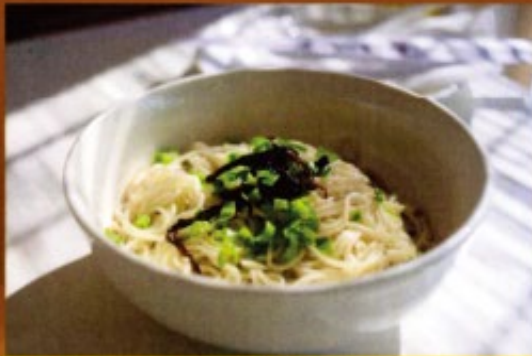
21 Noodles w. Scallion Sauce 6.95 蔥油拌麵 흥포우 쇠고기