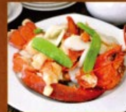
64 Rice Cake w. Lobster SP