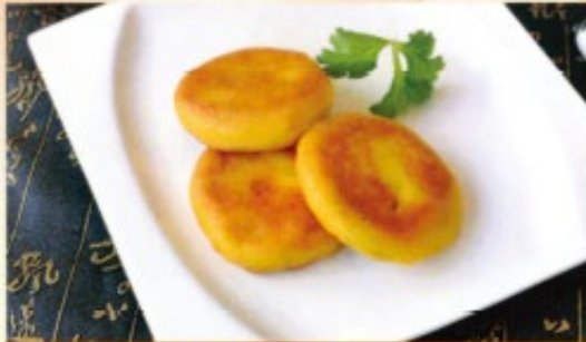
84 Pumpkin Cake w. Bean Paste Filling (4) 5.95 豆沙南瓜餅 팥난과빙