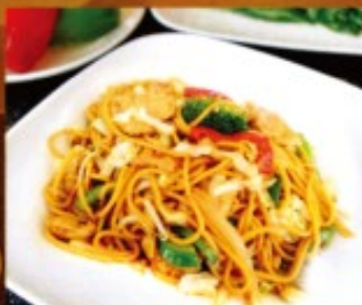
66 Chicken Lo Mein 9.95 雞撈面 치킨 면요리