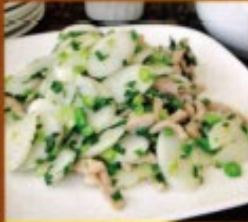
59 Rice Cake w. Shredded Pork & Pickled Cabbage 10.95 醬菜肉絲炒年糕 쉬에차이러우쓰떡볶이