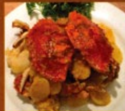
63 Rice Cake w. Blue Crab 15.95