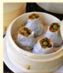
8 Sticky Rice Shumai (4) 6.95 糯米燒賣 나미샤오마이