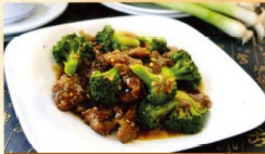
37 Beef with Broccoli 13.95 芥蘭牛 소고기와 브로콜리