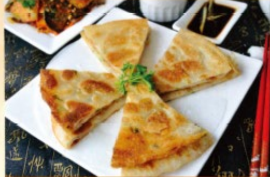
3 Scallion Pancake 3.95 蔥油餅 파전병