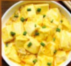
39 Tofu with Crab Meat 12.95 蟹粉豆腐 하이컨두부