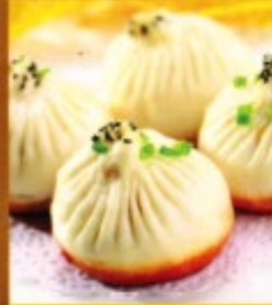
12 Pan Fried Pork Buns (4) 7.95 鮮肉生煎包 고기소성지옌