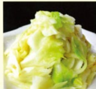
46 Sautéed Cabbage 10.95 清炒高麗菜 양배추 볶음