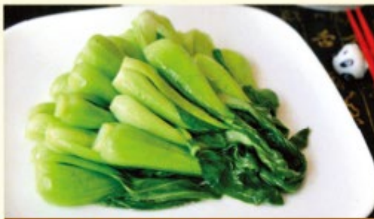
43 Sautéed Baby Bok Choy w. Garlic 10.95 蒜炒上海苗 갈릭상하이묘