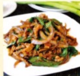
33 Pork w. Scallion 11.95