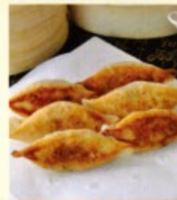
6 Pan Fried Veg. & Pork Dumpling (6) 7.95 菜肉鍋貼 야채고기성지연