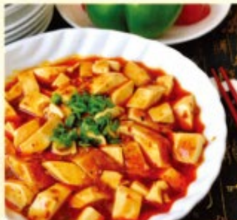
45 Mapo Tofu 10.95 麻婆豆腐 마파 두부