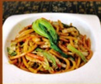
51 Fried Udon w. Veg. 素菜粗炒麵 야채떡볶음면