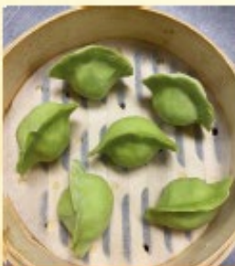
13a Vegetable Dumpling (6) 6.95 菜餃 야채 만두