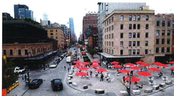
Tables, Chairs and Umbrellas at Gansevoort Plaza

During construction hours, you can expect an increased level of dust, noise, and heavy equipment. Vehicular travel lane closures will be required, as well as detours. Warning signs will be posted in advance. Parking and driveway/loading dock restrictions; signage will be posted within the affected areas. Emergency vehicle access and pedestrian access to sidewalk and buildings will always be maintained.