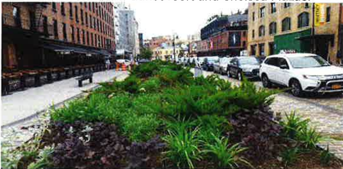
Spring Landscaping on 9 th Avenue between West 14 th Street and West 13 th Street

The project placed cobblestone along the sidewalk in the tree pits of 9 th Avenue between West 14 th St & West 15 th Street, West 13 th Street between 9 th Avenue & Hudson Street, and Gansevoort Street between Hudson Street & Greenwich Street. As well as the crosswalk on West 14 th Street between Hudson Street & 9 th Avenue. The planting of trees, shrubs, and perennials was completed throughout the project. The slip lane on 9 th Avenue between West 14 th Street and West 15 th Street has been temporarily paved. New concrete sidewalk was installed on 9 th Avenue between West 14 th Street and West 15 th Street (East Side) and at S/W/C of Hudson Street & West 13 th Street. New traffic signals were installed at the intersection of West 13 th Street & Hudson Street. New street lights were installed along 9 th Avenue and Hudson Street between Gansevoort St & West 14 th Street. New tables, chairs and umbrellas have been installed in Gansevoort and Chelsea Plazas.