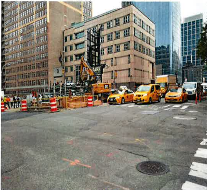
9 th Avenue, between W. 30 th & W. 31 st Streets (36" / 48" TWM installation)

Throughout the course of this project, the traffic lane will be maintained throughout the work zone with "No Parking" construction signs posted. Pedestrian flaggers will assist with construction/emergency access during work hours.