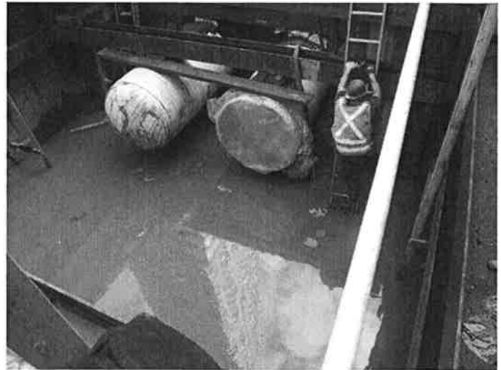
Excavation for the Double Flange Chamber at 9 th Avenue and W. 59 th Street.

Proper trash collection can be a challenge on a project as large as this but if everyone is considerate it can be managed with a modicum of disruption. Please pack your trash properly to avoid easy breakage and/or spill over. Put it in the designated areas as close to collection time as possible. If you use a private carter, ensure your trash collection occurs in a timely fashion. If you aren't sure where to bring your trash, please contact the CCL.