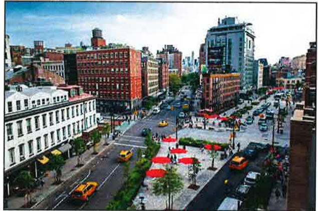
Chelsea Plaza on 9th Ave between W. 14th and W. 15th Streets

The Meatpacking District BID celebrated the opening of Gansevoort Plaza and Chelsea Plaza on August 6th, 2019 with a ribbon cutting ceremony. The Plazas are now open to the public. The Punch List corrective work south of West 14th Street has commenced, including cobblestone, curb and sidewalk repairs, & fire hydrants work. All surface work south of West 14th Street has been completed. The contractor continued to relocate the utility facilities north of West 14th Street that conflict with the proposed contract work.