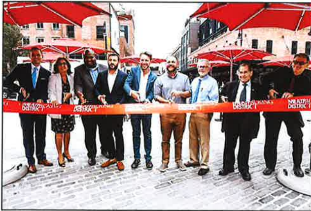
Gansevoort Plaza Ribbon Cutting Ceremony