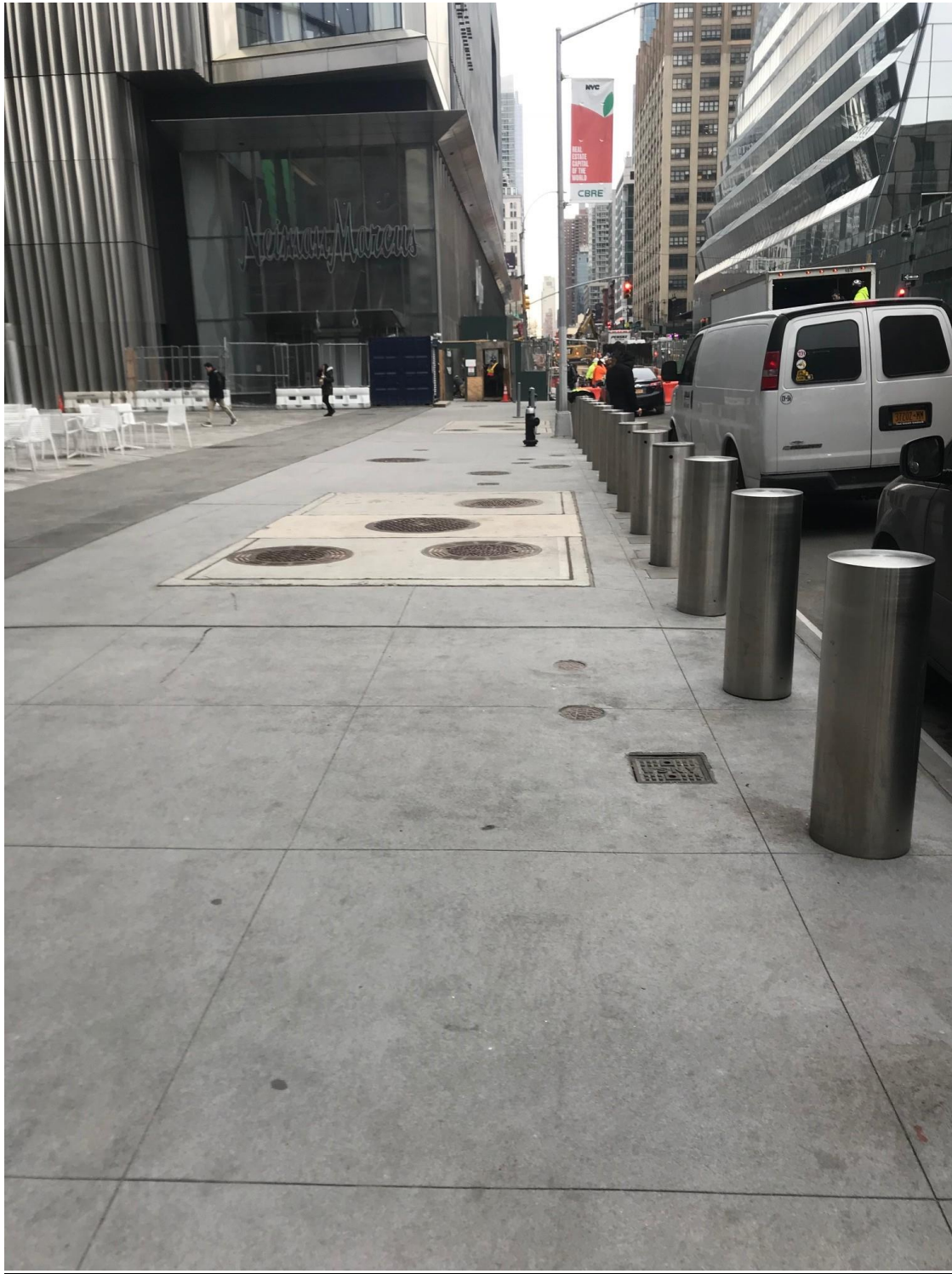
EXHIBIT A: CURRENT SITE PHOTO