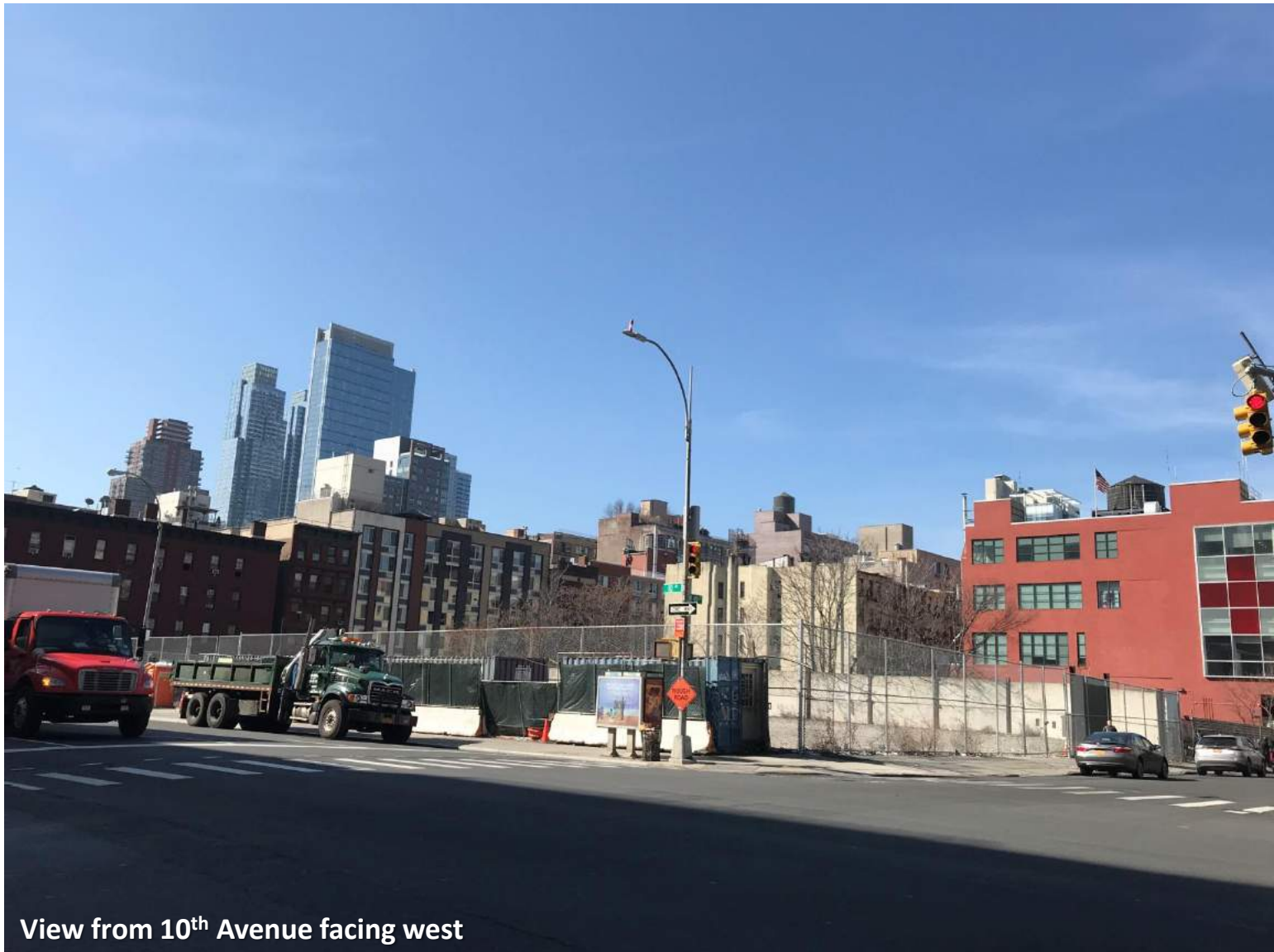
View from 10 th Avenue facing west