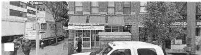
At this location