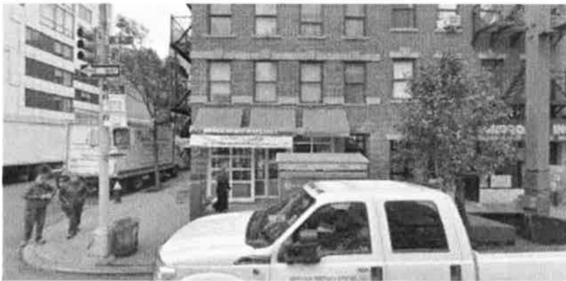
523 9th Ave New York, NY 10018