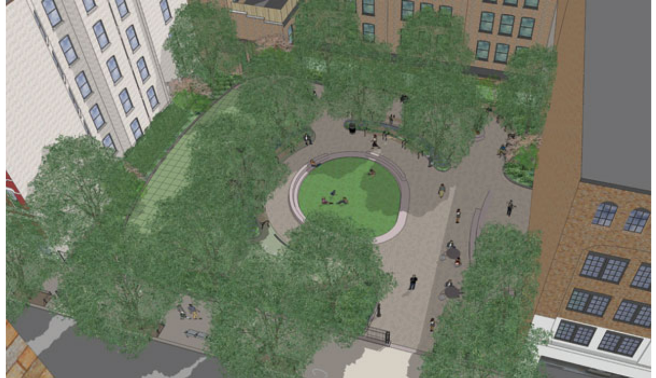
A rendering of CB4's newest green space, 20 th Street Park