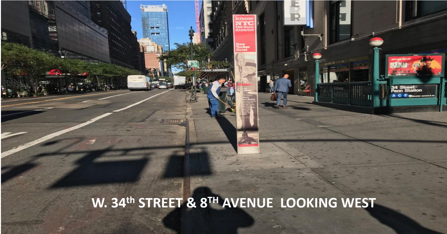
W. 34 th STREET & 8 TH AVENUE LOOKING WEST