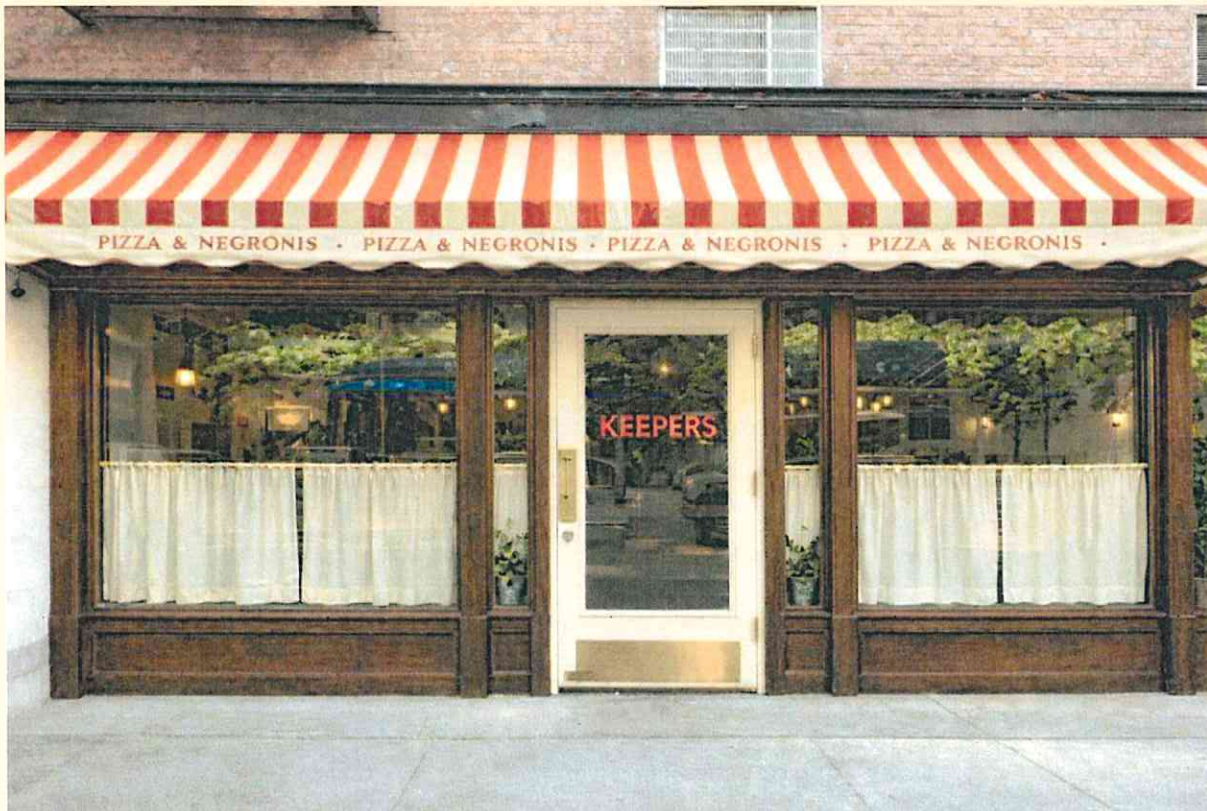
Burnt orange and cream striped awning, sand and stain exterior wood, new cream door, branding on the awning and the glass door.