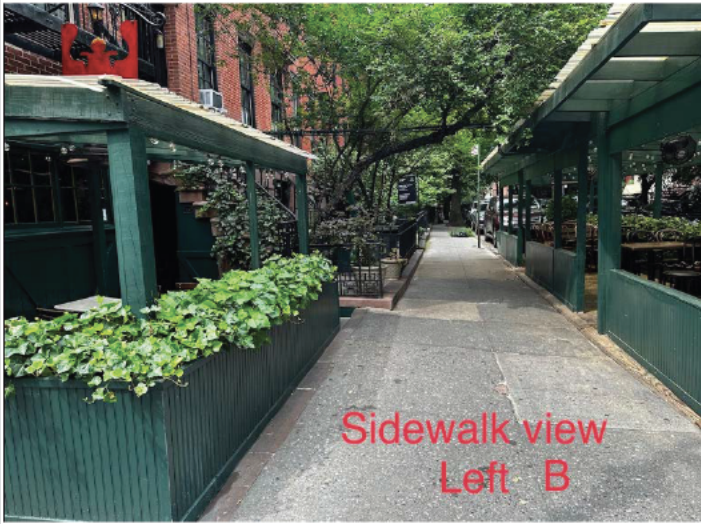
Sidewalk view Left B