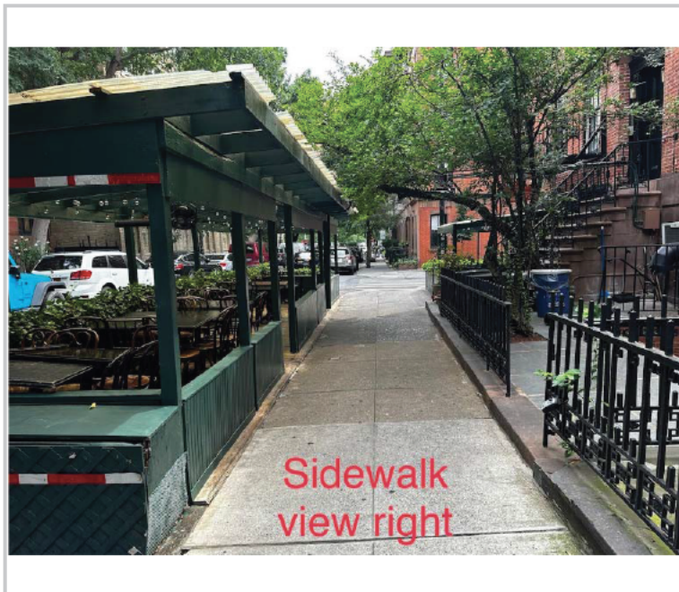
Sidewalk view right