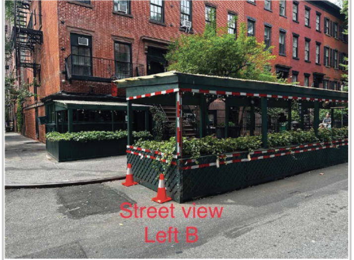
Street view Left B