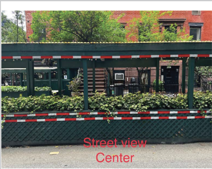
Street view Center