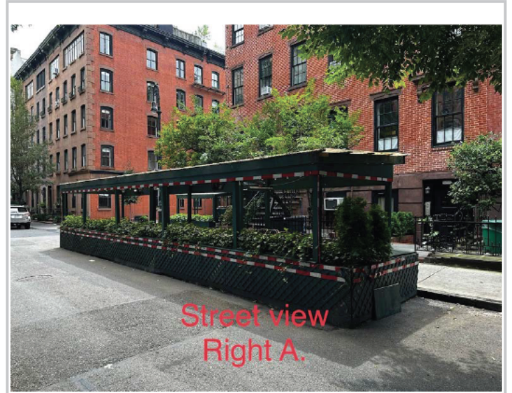
Street view Right A.