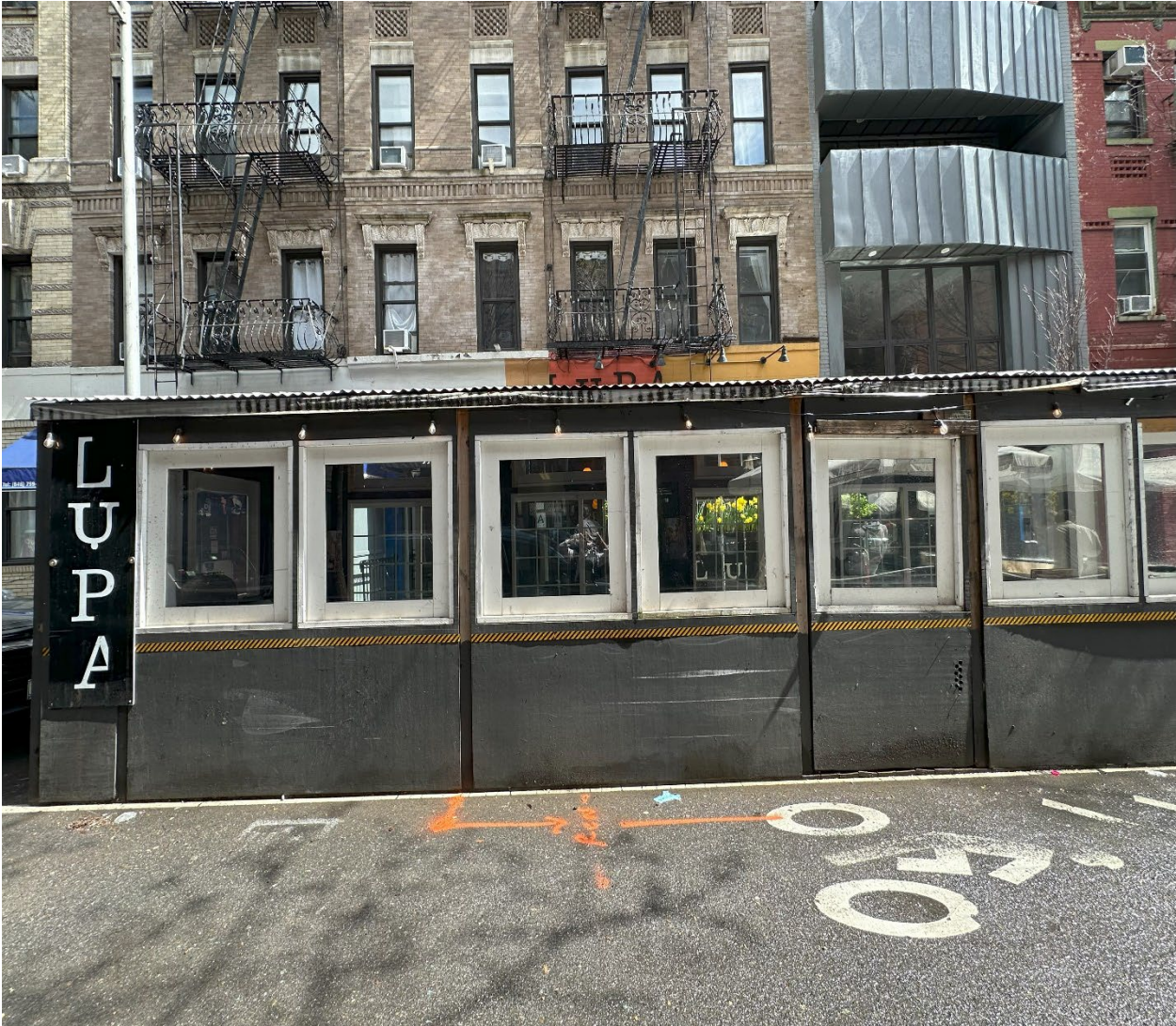
Site Photos- LUPA OSTERIA ROMANA (20240426010001)