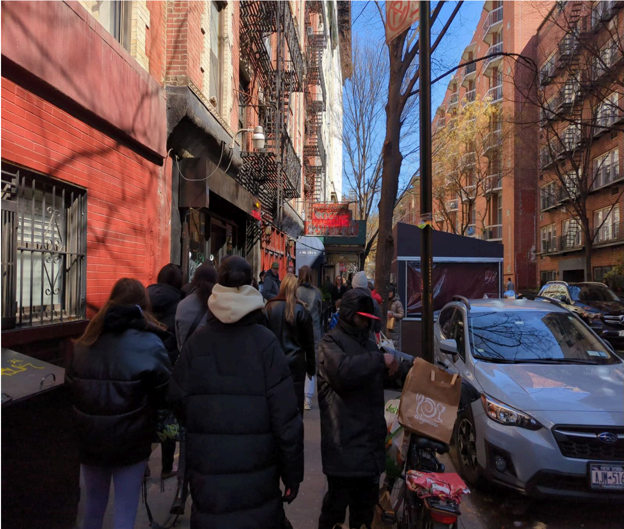
Site Photos- PopUp Bagels (20240325010002)