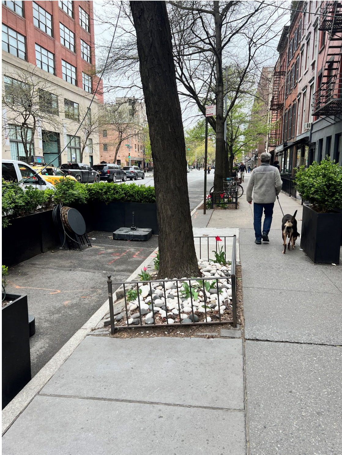
Site Photos- LELABAR (20240423010003)