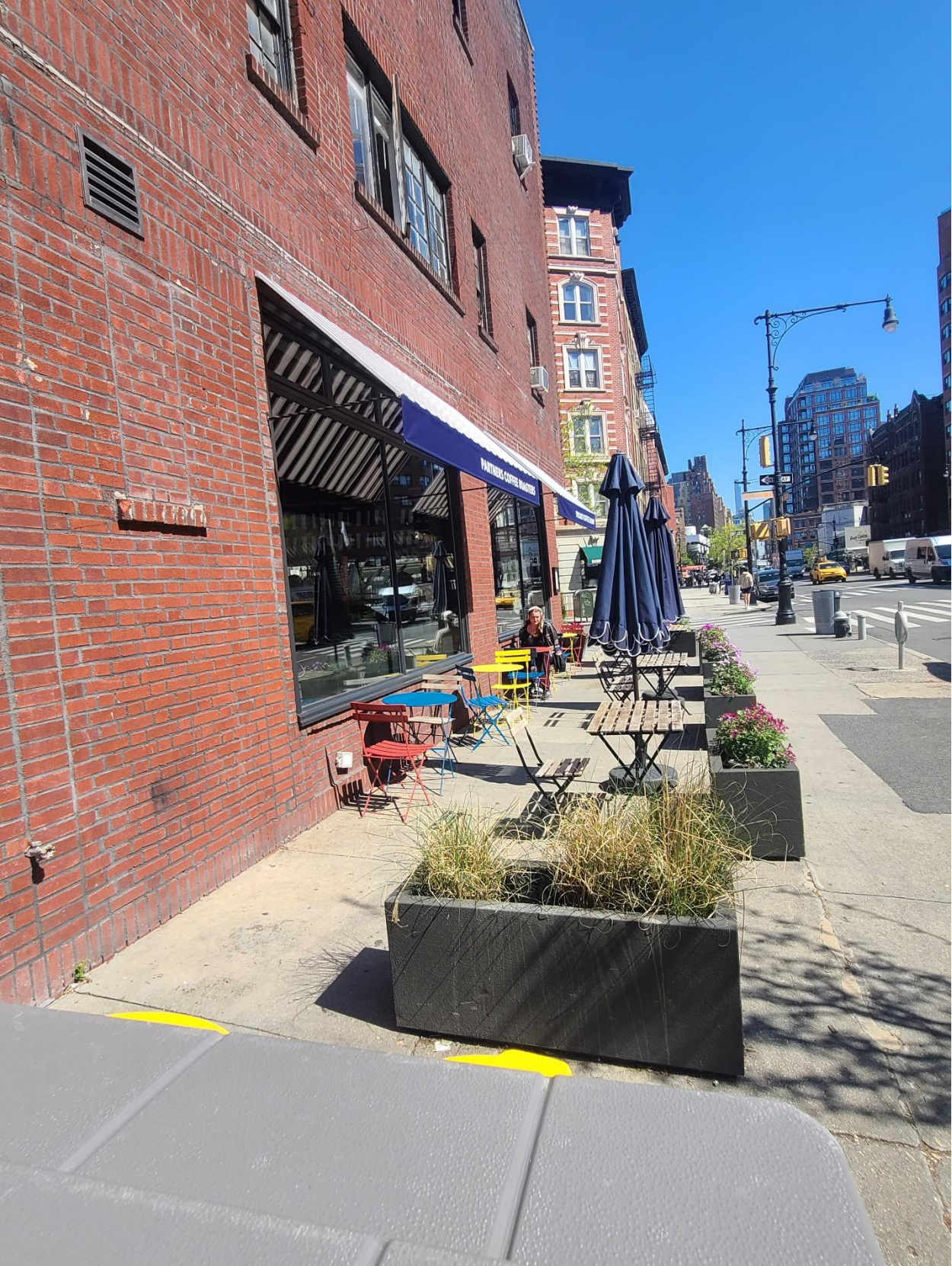
Site Photos – Partners Coffee (20240506010005)