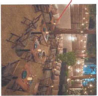
Built-in Banquette-Design Inspiration