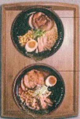
Kyushu Tonkatsu Shoyu Ramen