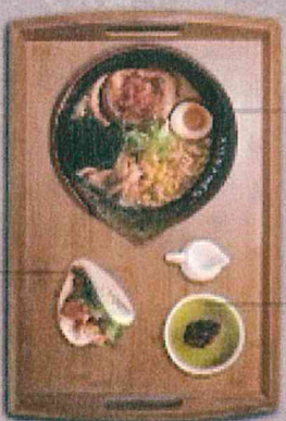
Tokyo Tonkatsu Shoyu Ramen