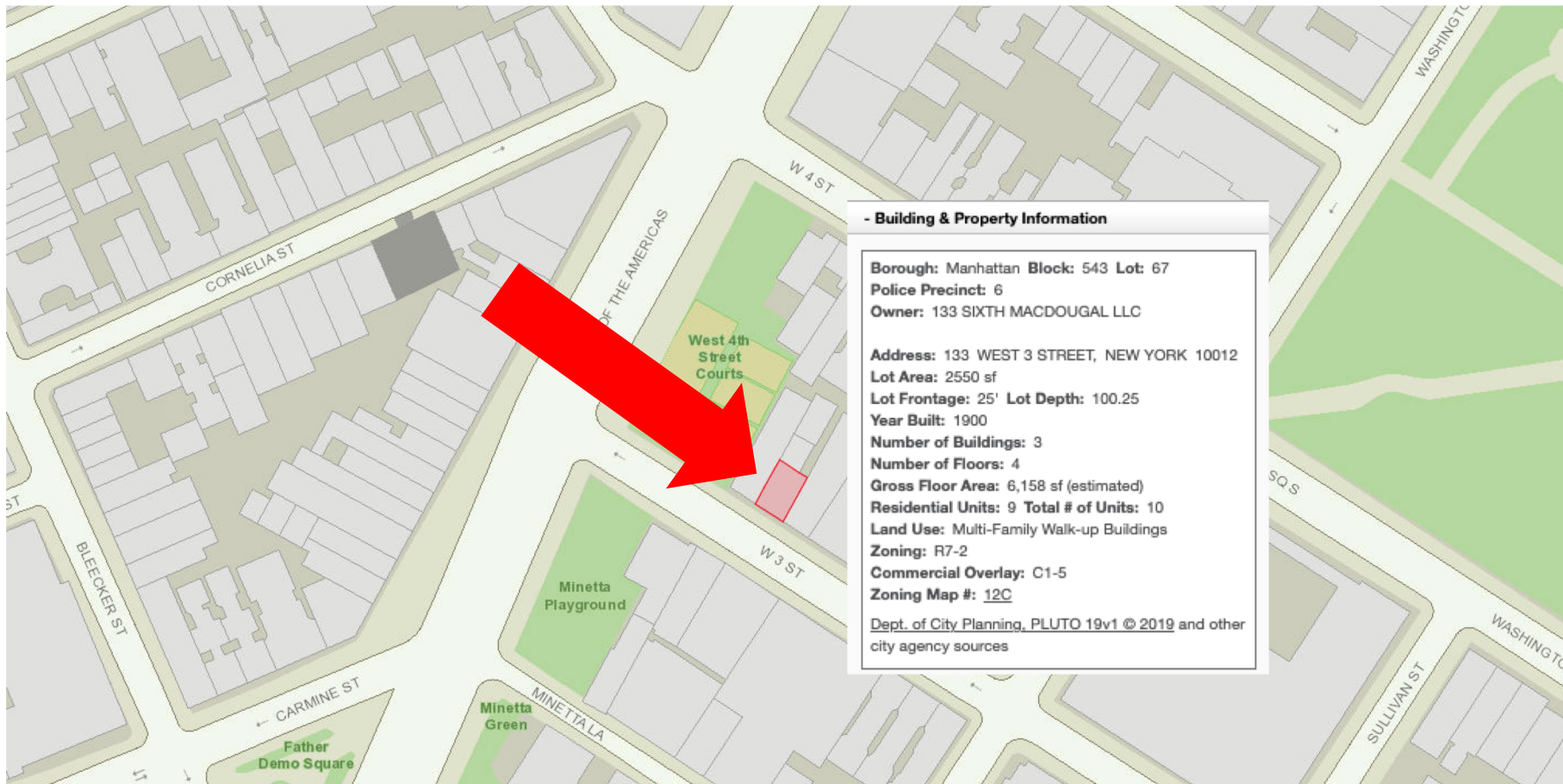
The property is located on West 3 rd Street, between 6 th Avenue and MacDougal Street in the South Village Historic District