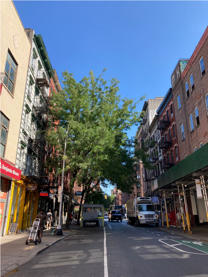
West 3 rd Street