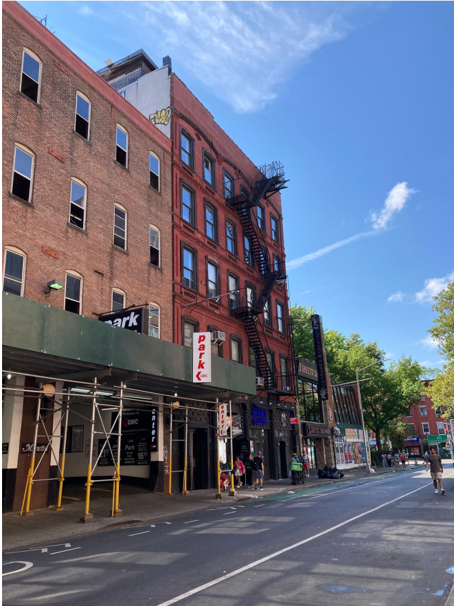
West 3 rd Street