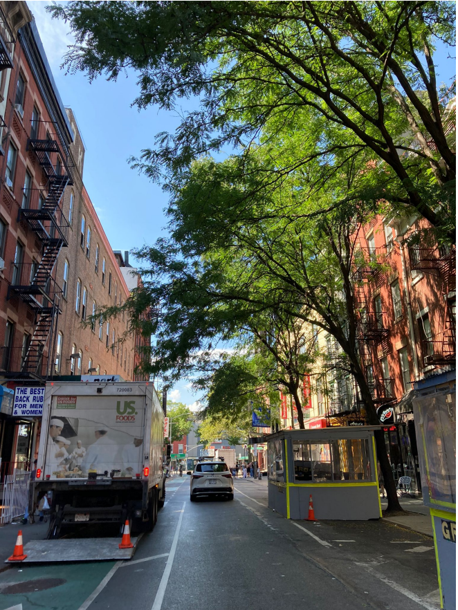
West 3 rd Street