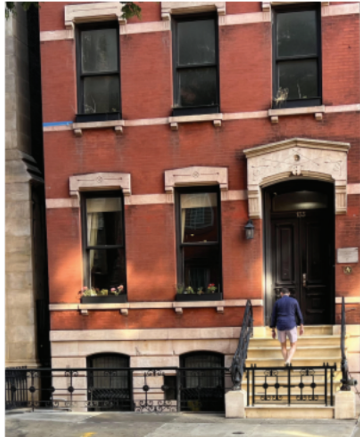
133 West 4 th Street