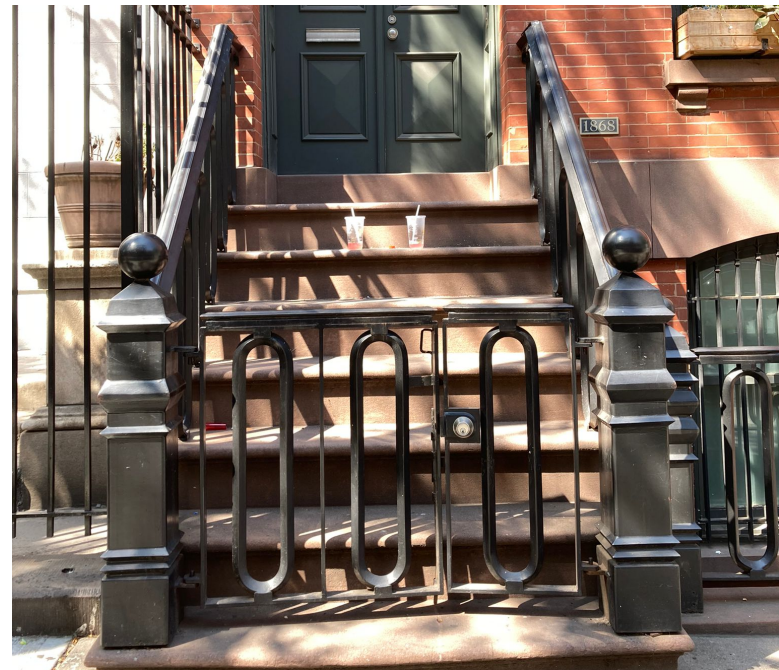
79 Christopher Street