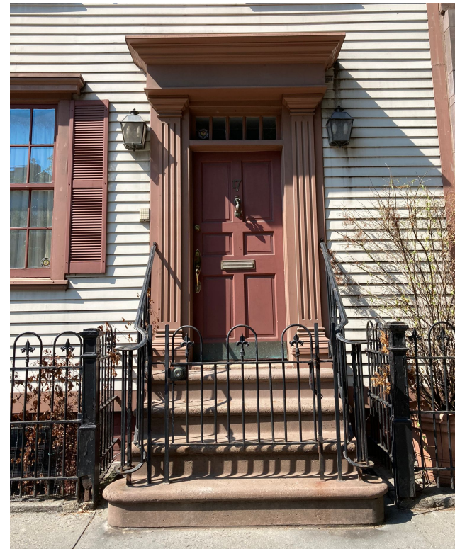
17 Grove Street