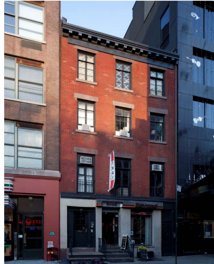
Conditions at time of designation