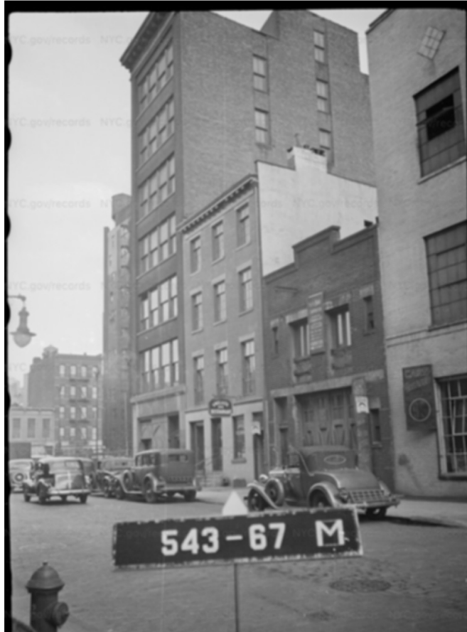
Tax photo (1940s)