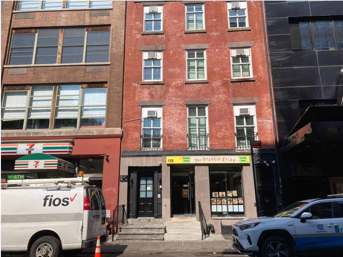
Existing conditions on 133 West 3 rd Street