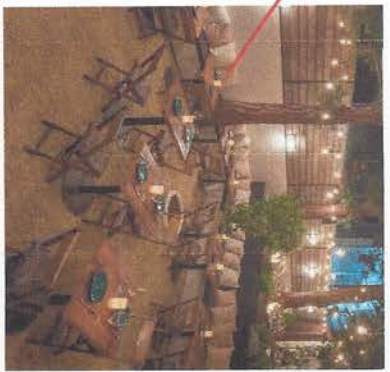
Built-in Banquette-Design Inspiration