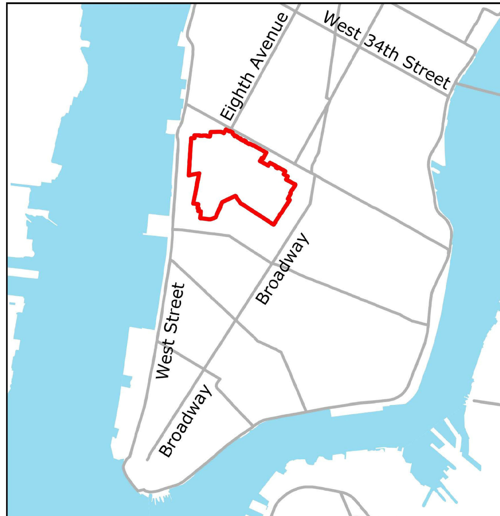
1 GREENWICH VILLAGE HISTORIC DISTRICT MAP SCALE: NTS