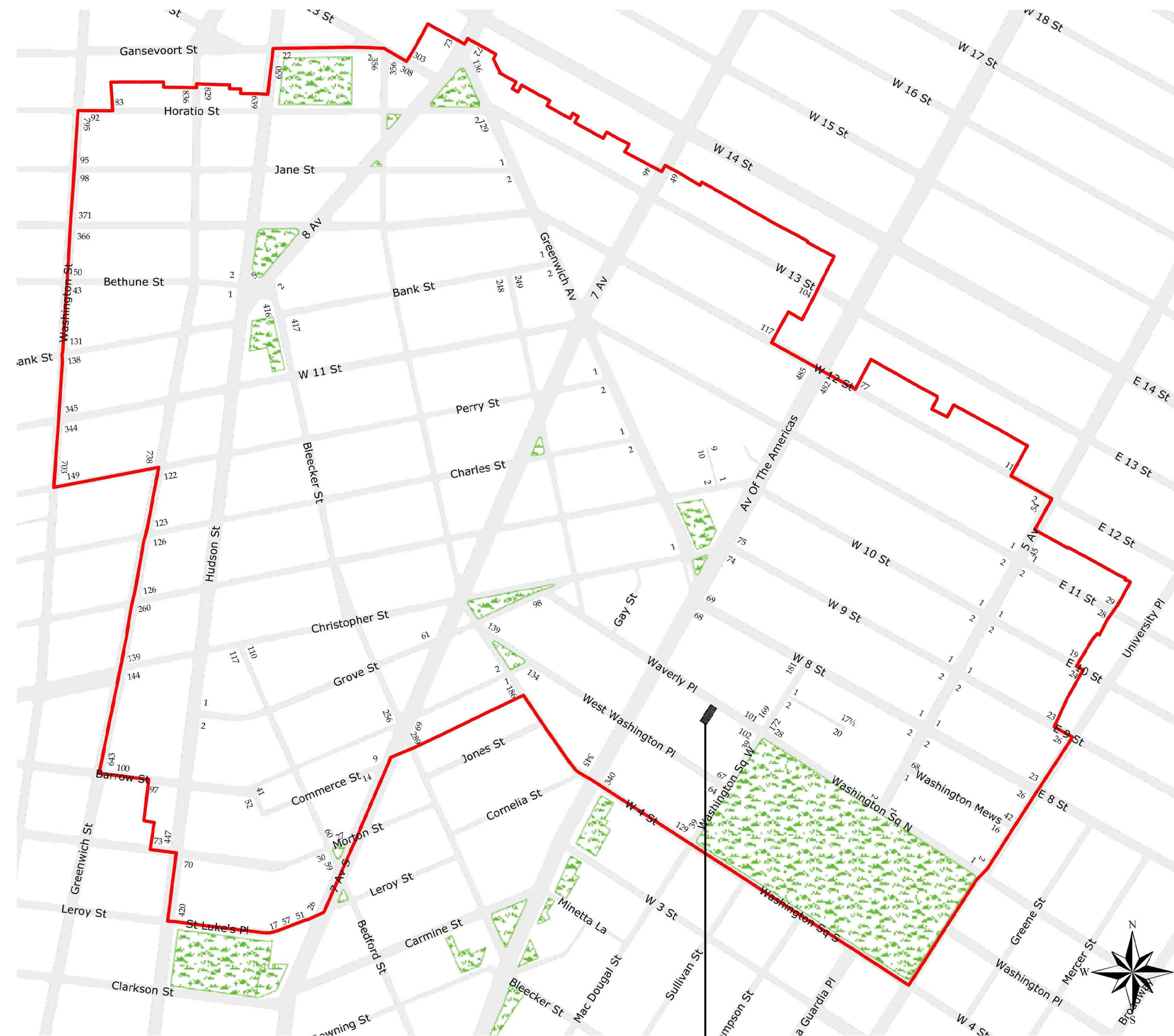
2 ENLARGED GREENWICH VILLAGE HISTORIC DISTRICT MAP SCALE: NTS