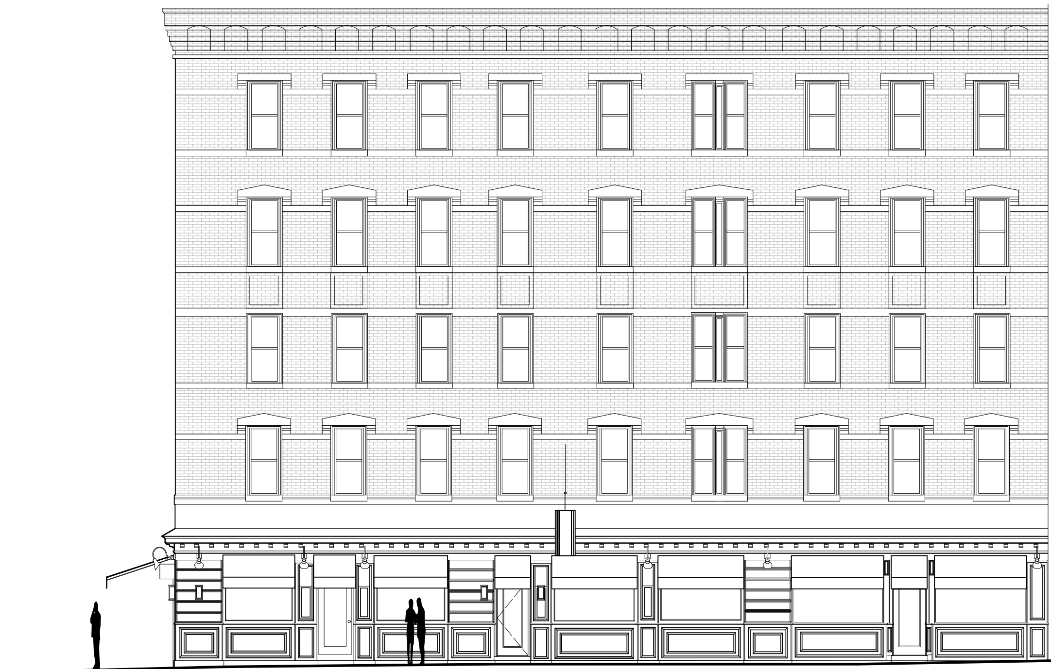
EXISTING GREENWICH AVENUE FACADE