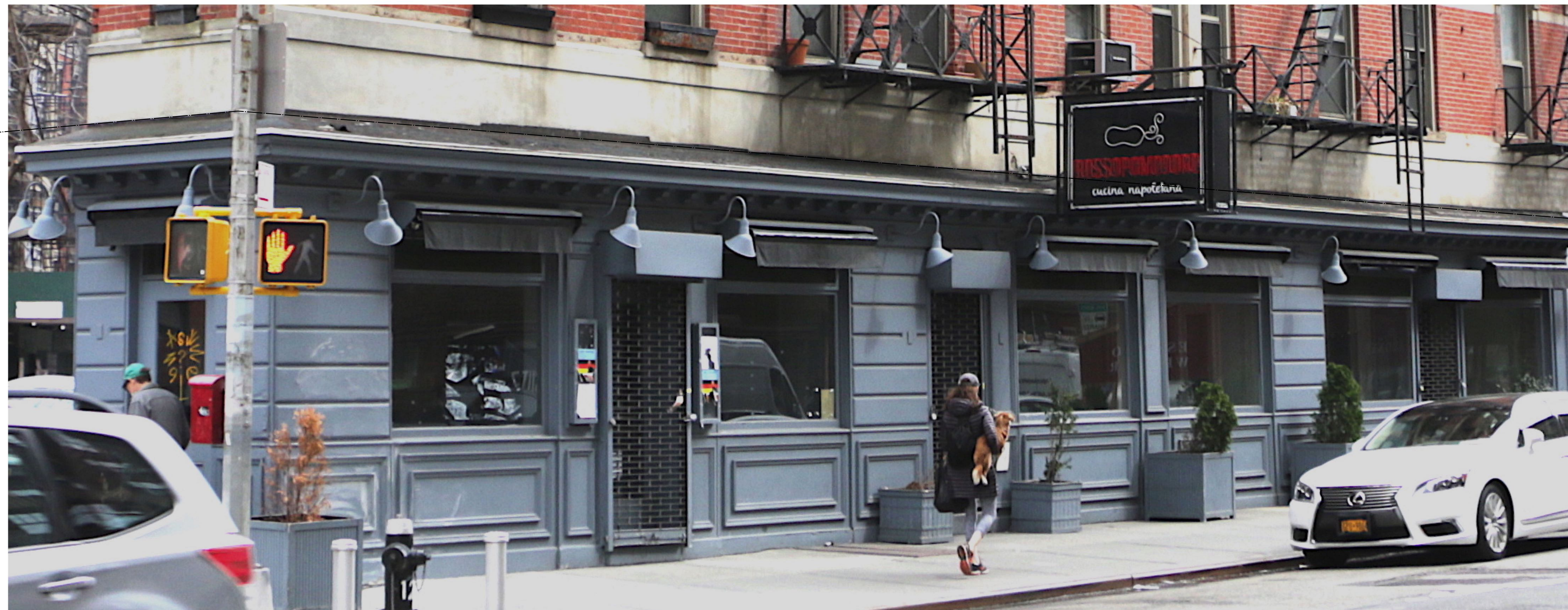
EXISTING WEST 13TH STREET FACADE

PROPOSED WORK IS FOR RE-PAINTING OF SURFACES BELOW EXISTING LIMESTONE FRIEZE LINE