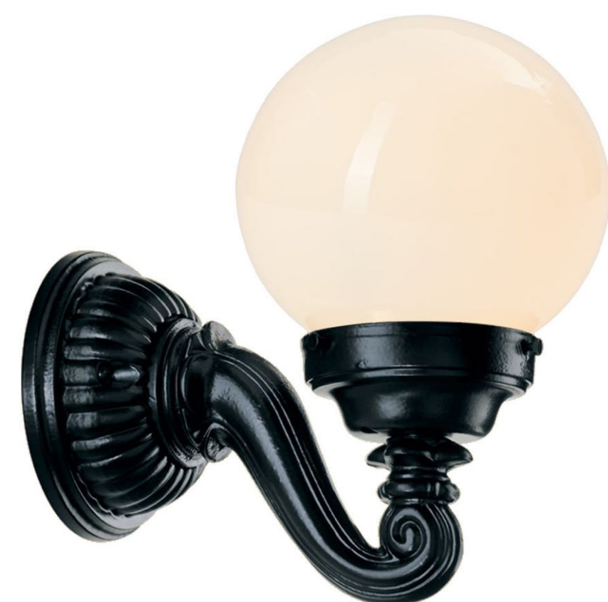
REJUVENATION 10" GLOBE