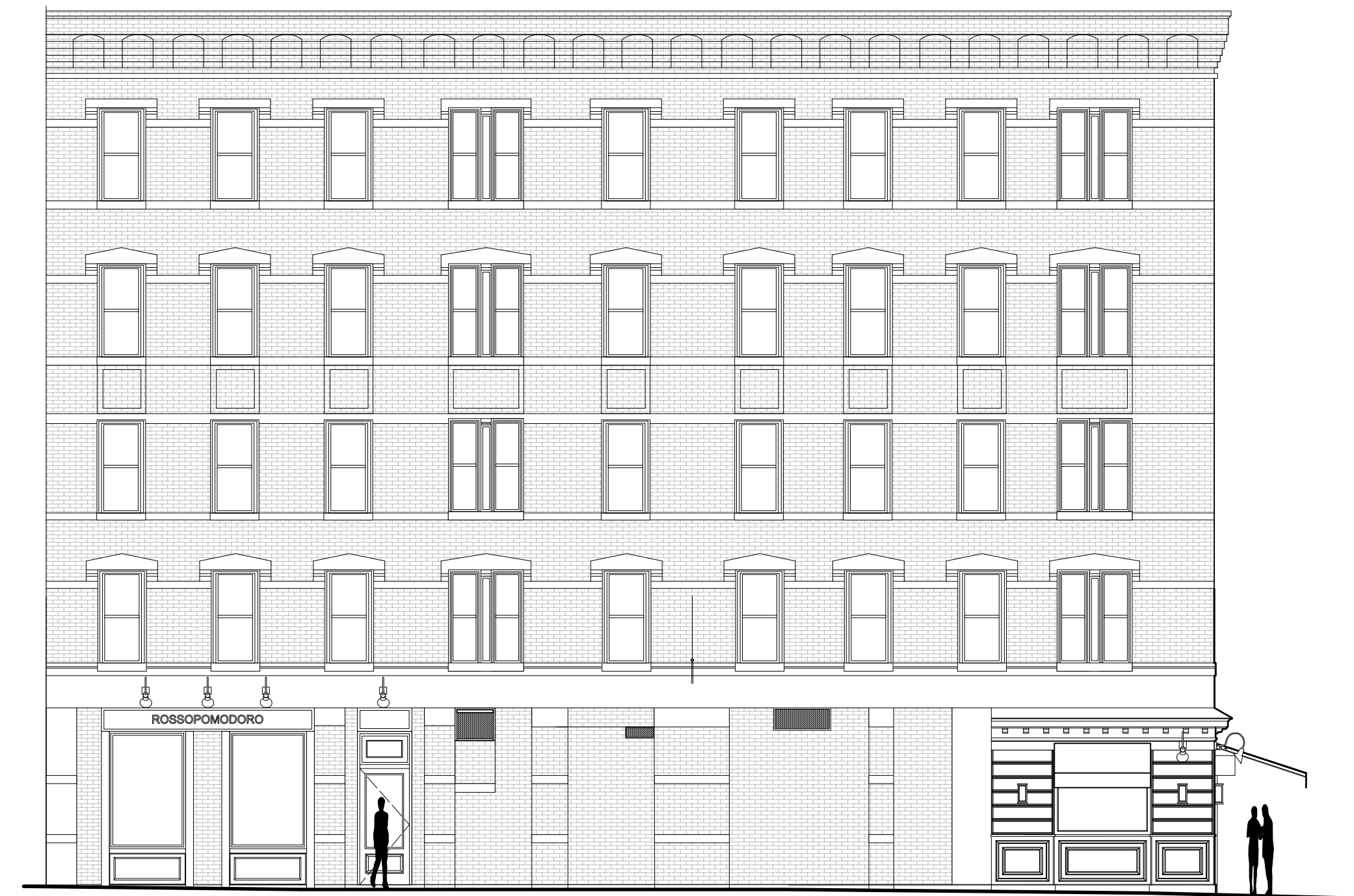
EXISTING WEST 13TH STREET FACADE