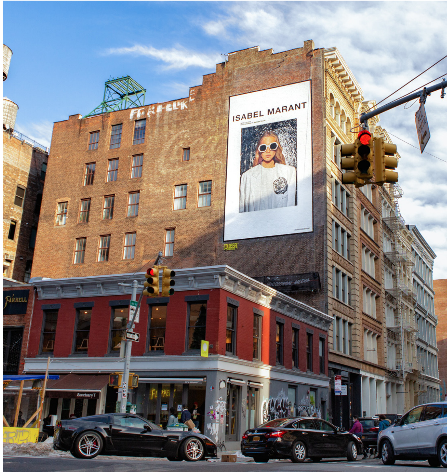
CURRENT CONDITION OF FACADE