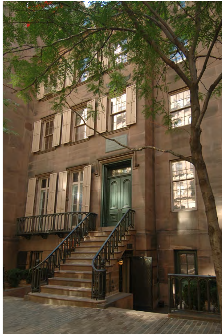
28 EAST 20TH STREET