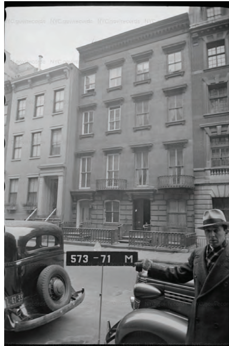
53 WEST 9TH STREET BUILT: 1854 for GOERGE BRODHEAD STYLE: ANGLO-ITALIANATE