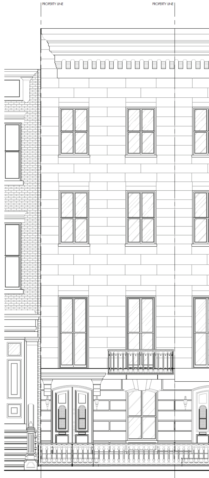
EXISTING FRONT FACADE

15 WATTS STREET 4TH FLOOR NEW YORK NY 10013