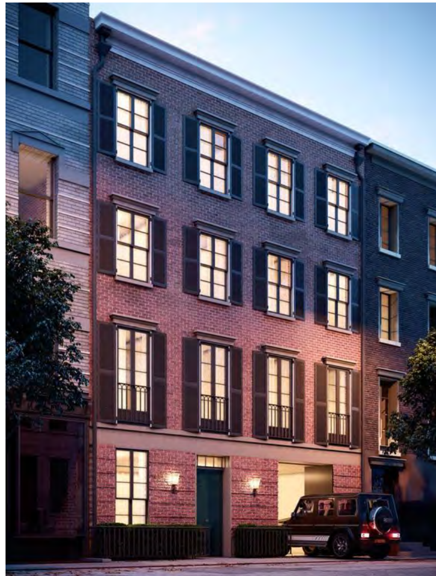
37-39 PERRY STREET, AT DESIGNATION