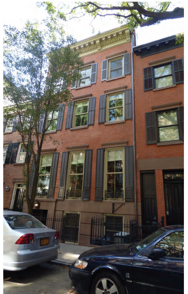
64 BANK STREET, LPC-APPROVED