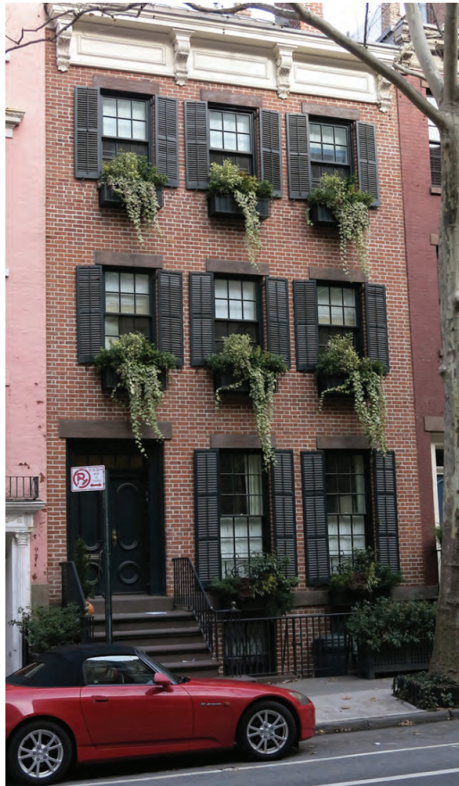
35 WEST 10TH STREET, AT DESIGNATION

15 WATTS STREET 4TH FLOOR NEW YORK NY 10013