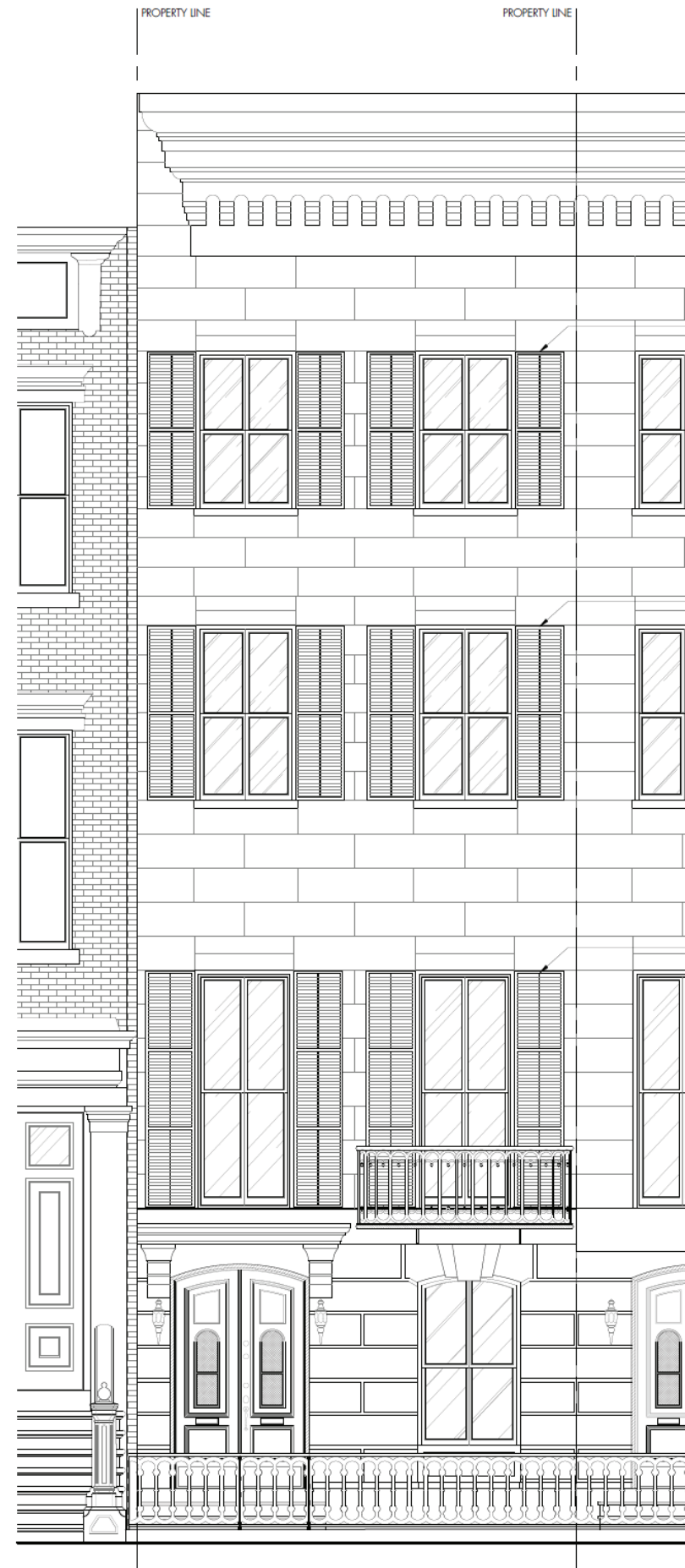
PROPOSED FRONT FACADE

PAINTED WOOD SHUTTERS INSTALLED AT EXISTING PINTLES W/ NEW SHUTTER STAYS