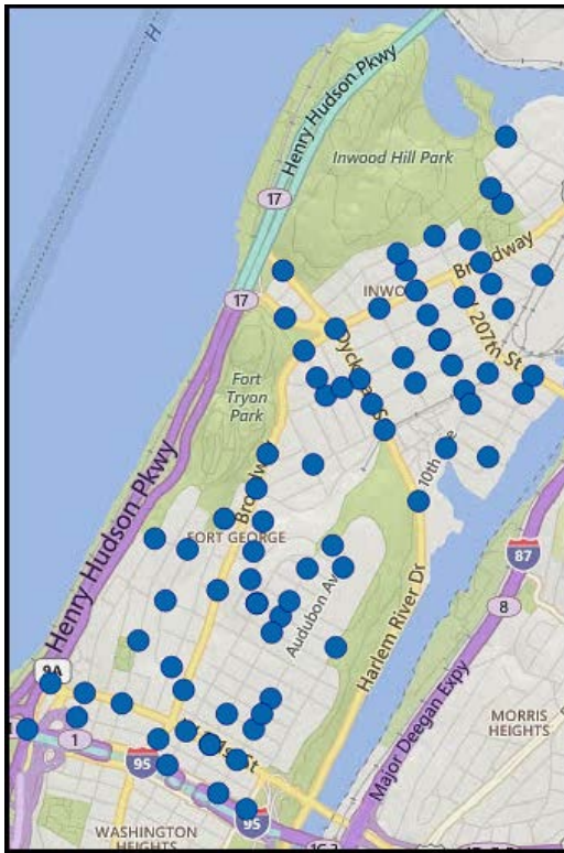
COMPStat 2.0 Year to Date Map and Charts.