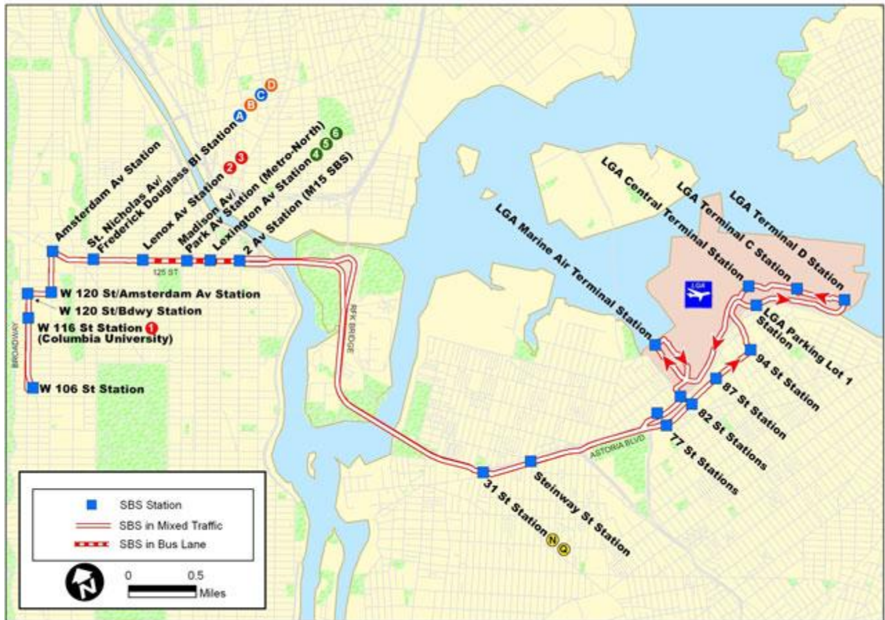
Map showing M60 SBS station locations

Check back soon for more information. Also, visit NYCDOT's page at: http://www.nyc.gov/html/brt/html/other/laguardia.shtml