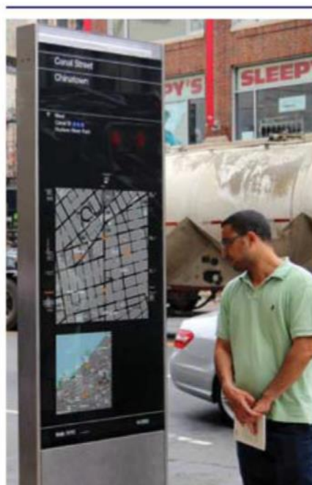
The local area map: Canal Street, Manhattan